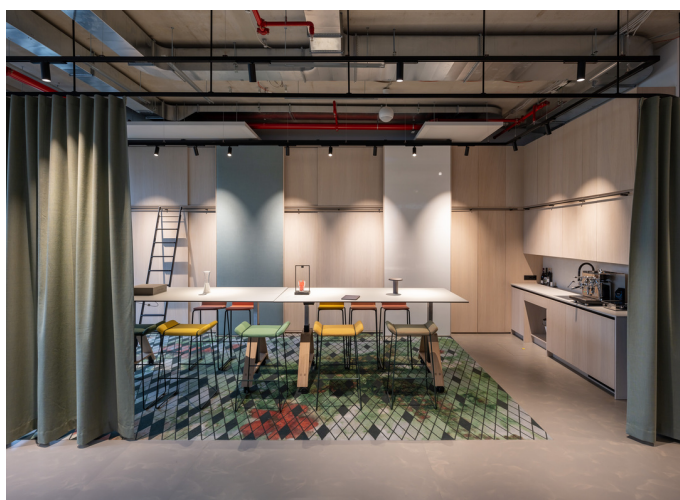
Vector Track - Carlotta de Bevilacqua