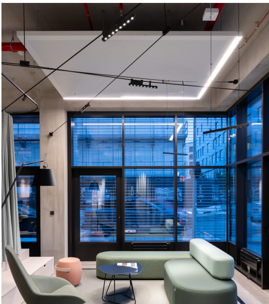
Funivia - Carlotta de Bevilacqua

➤ Jahr / 2023 Kategorie / Office