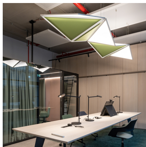
Flexia - Mario Cucinella | Demetra Table - Naoto Fukasawa