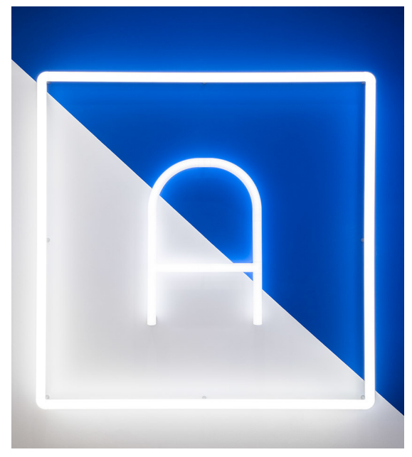
Alphabet of Light by BIG

Design City Week is an opportunity to present new evolutions of the Alphabet of Light, Gople System and La Linea projects designed by BIG - Bjarke Ingels Group, as well as the entire Gople family, Gople Portable/Plug and the new Gople Outdoor.