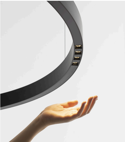
A.24 with Sharp emission

➤ Since the 1990s, "The Human Light" has been the beginning of a path that declares more and more explicitly an approach to the project guided by values, driven not only by scientific research and technological and productive expertise but also by a humanistic and ethical approach.