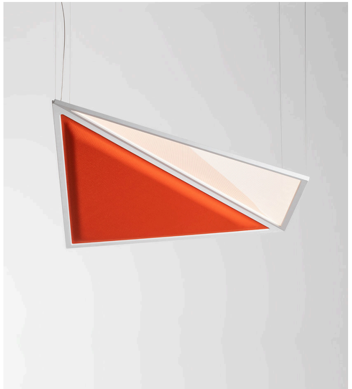
Flexia Suspension, Mario Cucinella

It fits transversely into all contexts where acoustic and visual well-being is required.