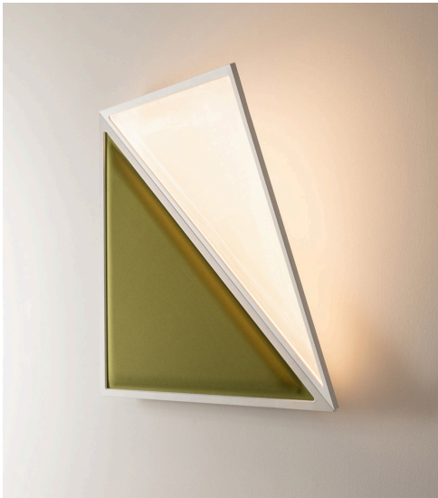
Flexia Wall, Mario Cucinella

↗ “Flexia is a play on perceptions, between the visible which is material and colour, and the invisible which becomes light”