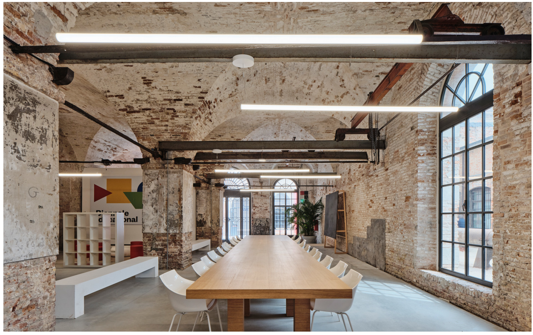
Alphabet of Light by BIG in the Educational room