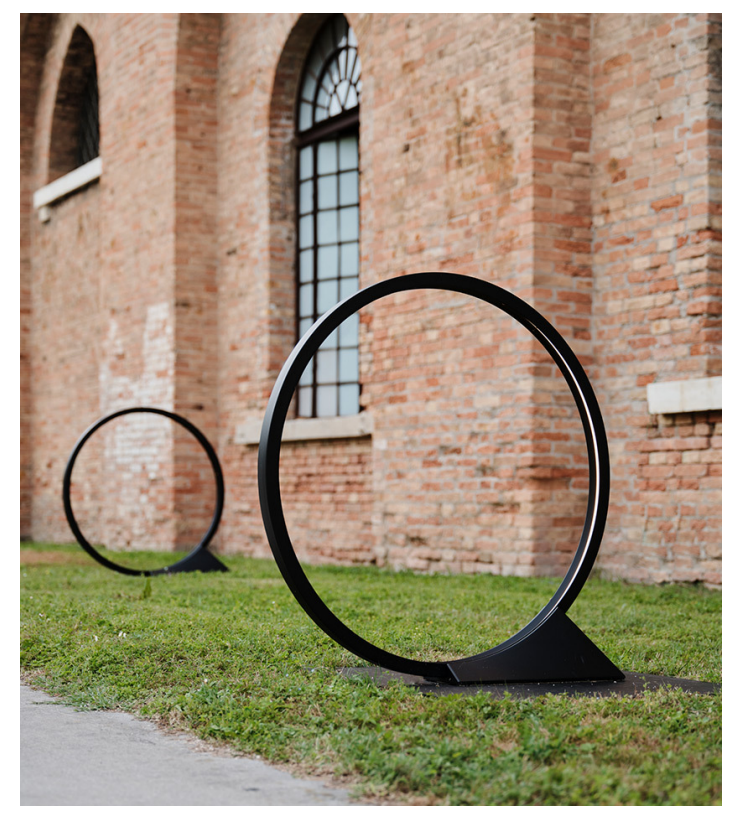
"O" by Elemental

La Biennale di Venezia is a place of listening, of inspirations and new encounters. This is where the collaboration with Alejandro Aravena was born in 2016, whose "O's" today illuminate the paths of the Arsenale with respect for nature, relating to the context like a frame that fits to underline perspectives.