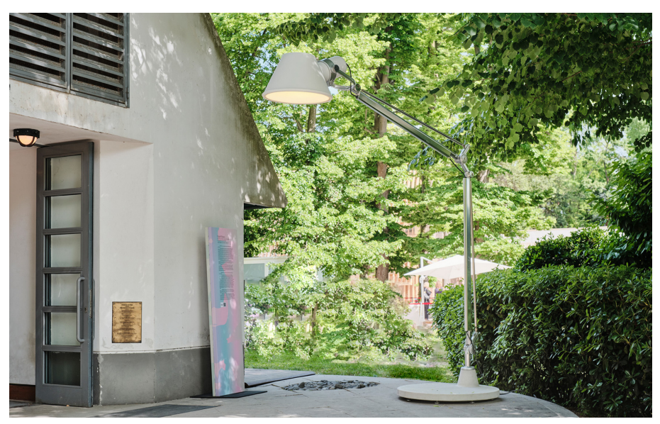
Tolomeo XXL by Michele De Lucchi and Giancarlo Fassina