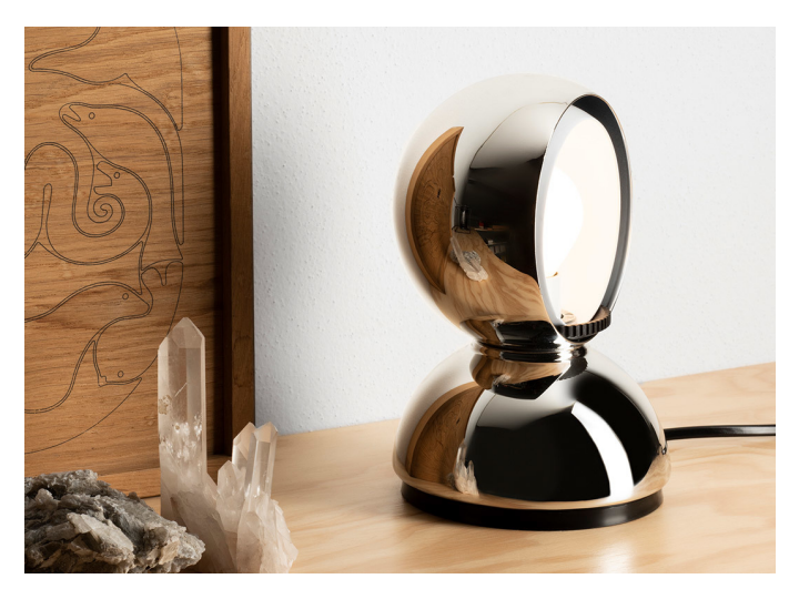
Eclisse PVD Mirror - Vico Magistretti