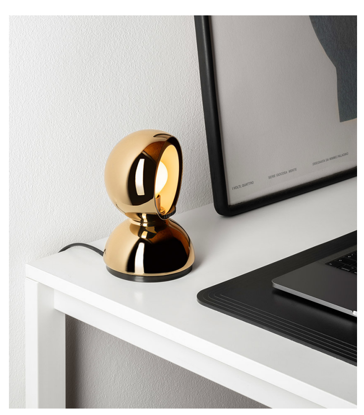
Eclisse PVD Brass - Vico Magistretti

The PVD versions of Eclisse are a perfect example of how Artemide's research into materials, finishes and processes is strongly oriented towards sustainable solutions. In the design choice, the environmental impact is a discriminating factor that imposes itself on the final aesthetic result.