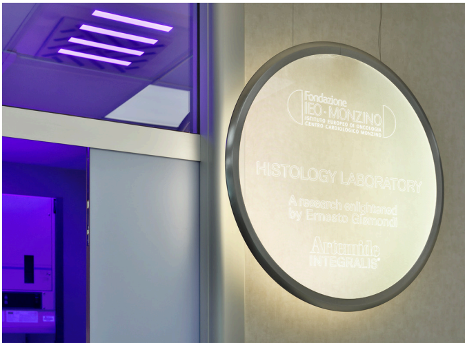
Discovery Special - Ernesto Gismondi | A.39 Diffused Pure Integralis - Carlotta de Bevilacqua

Two laboratories, the Microscopy laboratory and the Histology laboratory, have been illuminated, with a focus on environmental conditions through the reduction, thanks to light, of pathogenic microorganisms.