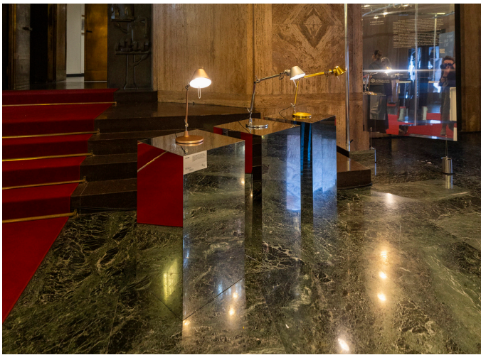
Tolomeo Micro Table - Michele De Lucchi & Giancarlo Piretti

Through two distinct narrative paths, visitors were able to immerse themselves in the fascination of our manufacturing: on the one side, admiring the forms and functionality of our design products, and on the other, exploring the secrets of our production through engaging immersive videos.