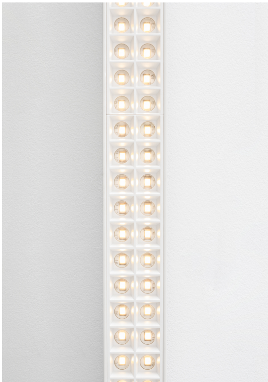
A.39 Sharp Microrefractive Emission - Carlotta de Bevilacqua

A cell of Refractive houses four cells of Microrefractive. This reduction in scale has led to an improvement in efficacy to 164 lm/W and an enhancement in uniformity by totally eliminating the multi-shadow effect.