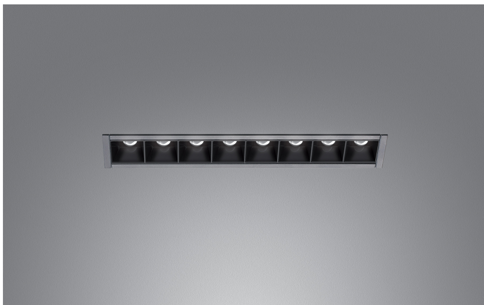
Sharp Refractive Emission - Carlotta de Bevilacqua