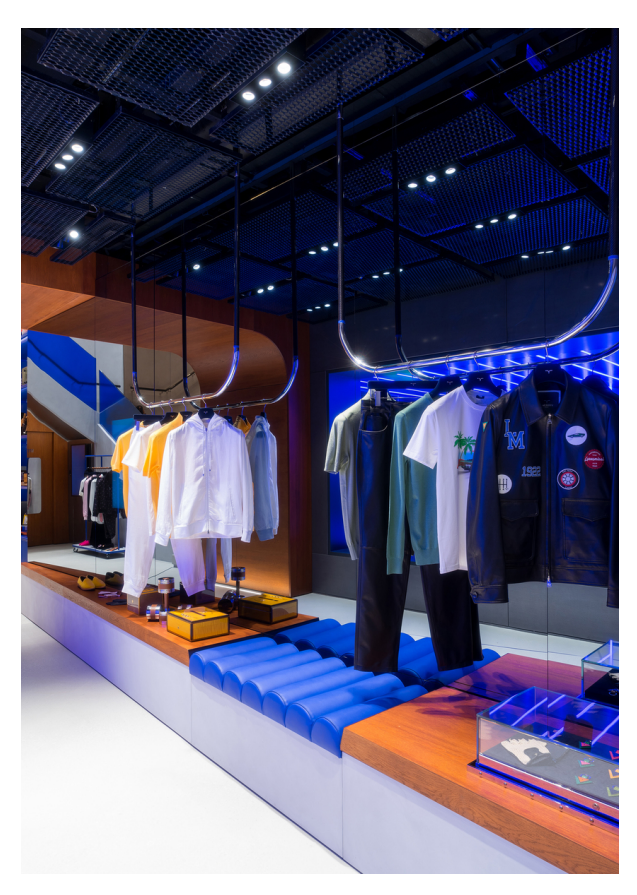
Custom Vector - Carlotta de Bevilacqua