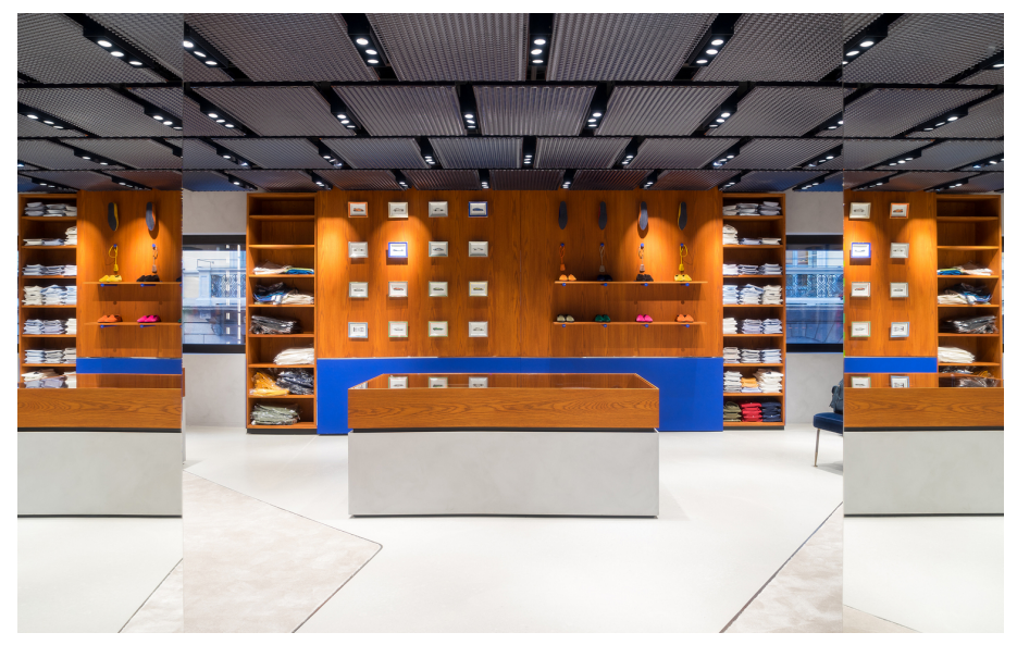
Custom Vector - Carlotta de Bevilacqua