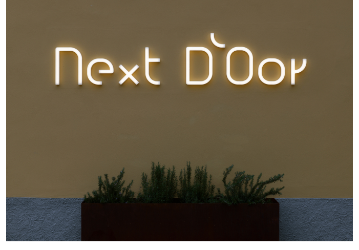
Alphabet of Light Letter Custom Outdoor - Bjarke Ingels Group