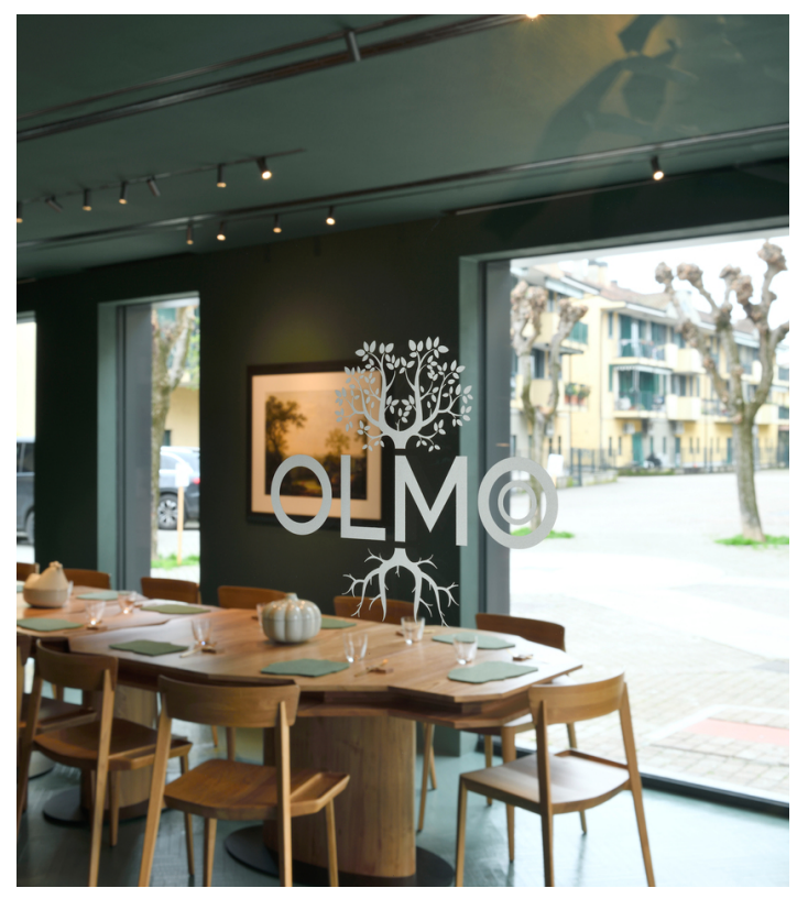
Turn Around + Vector - Carlotta de Bevilacqua

Artemide and celebrity chef Davide Oldani join forces once again to illuminate the new "Olmo" restaurant with a unique and long-established synergy. Located in a charming little square, the restaurant takes its name from the imposing tree that stands in the centre, deeply rooted in the ground and reaching upwards, symbolising stability and growth.