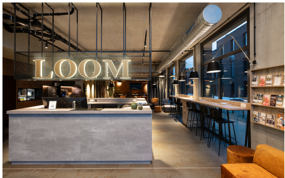
Tolomeo Mega Wall - Michele De Lucchi & Giancarlo Fassina

Industrial design, lifestyle and extraordinary architecture merge with each other - and a place with a special feel-good atmosphere is created. From the Loom Skybar on the sixth floor you can enjoy the view over the city.