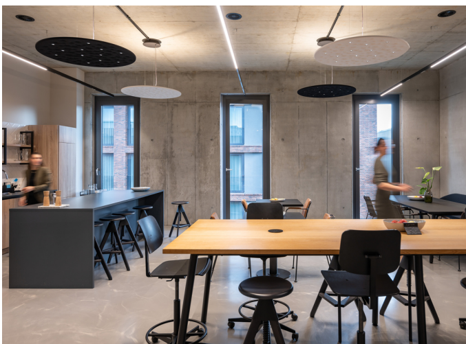
Silent Field 2.0 - Carlotta de Bevilacqua & Laura Pessoni