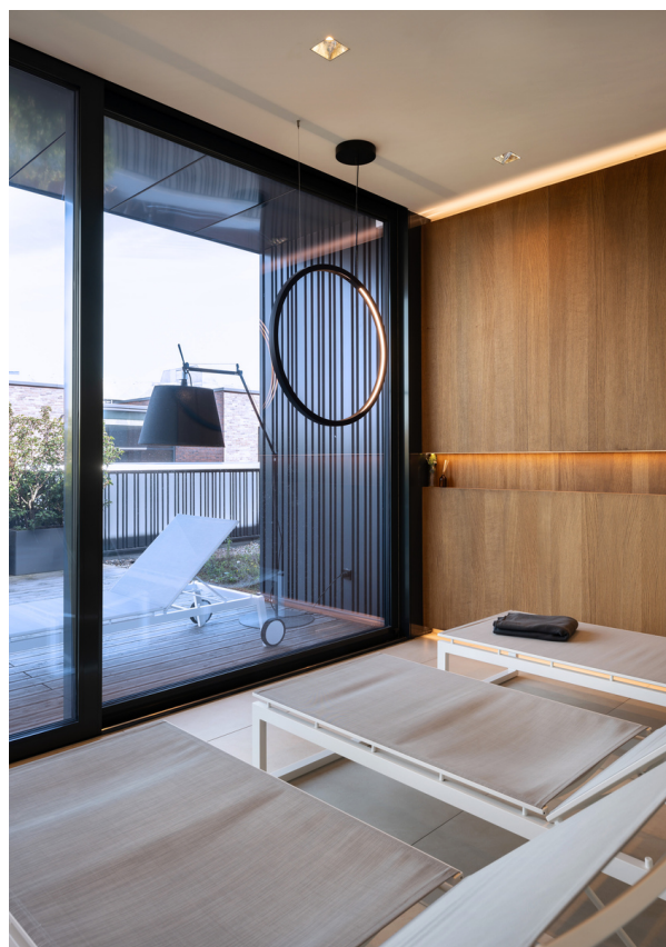
"O" - Elemental

At the Nice Fitness & Spa, guests will have access to a state-of-the-art studio and wellness oasis for body and mind. Located in the buildings of the remarkable Buntweberei meeting place, the club offers a spacious studio with a dedicated spa area and physiotherapy services.