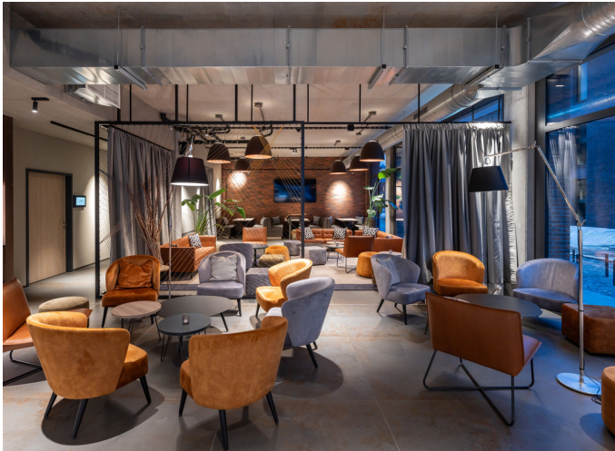
Nur - Ernesto Gismondi | Tolomeo Mega Floor - Michele De Lucchi & Giancarlo Fassina