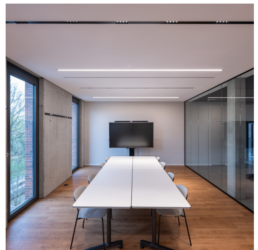
A.24 Sharping Emission - Carlotta de Bevilacqua