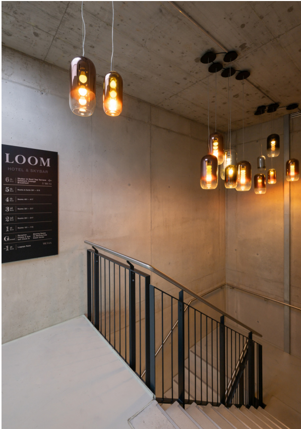
Gople - Bjarke Ingels Group