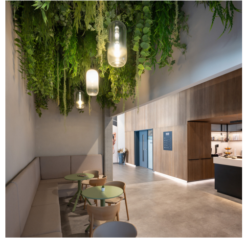
Gople - Bjarke Ingels Group