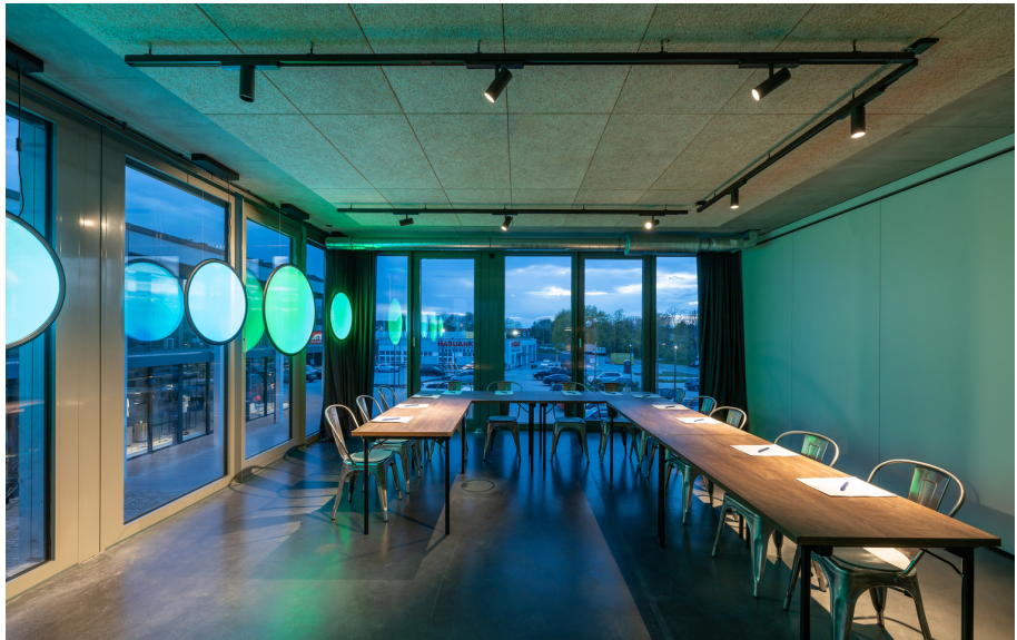
Discovery Vertical - Ernesto Gismondi | Vector Track - Carlotta de Bevilacqua