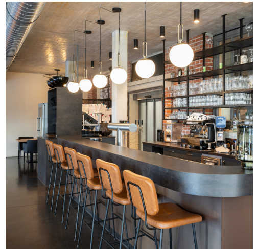
nh Suspension - Neri&Hu

Industrial design, lifestyle and extraordinary architecture merge with each other - and a place with a special feel-good atmosphere is created. From the Loom Skybar on the sixth floor you can enjoy the view over the city.