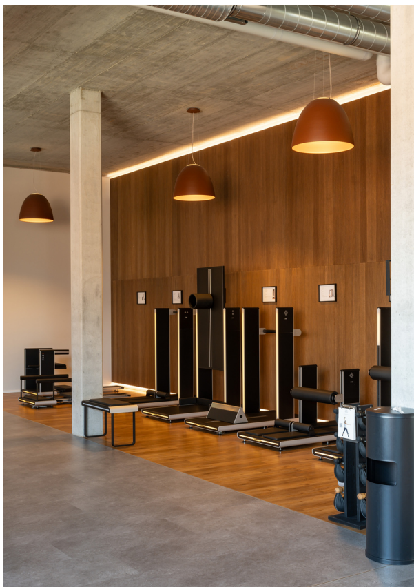
Nur - Ernesto Gismondi