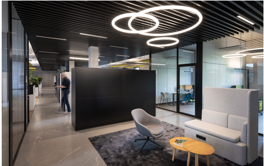
Alphabet of Light Circular - Bjarke Ingels Group

Salvia Group covers the entire technical life cycle of buildings. From planning to management and service. With more than 26 locations throughout Germany, it can realise projects of any size.