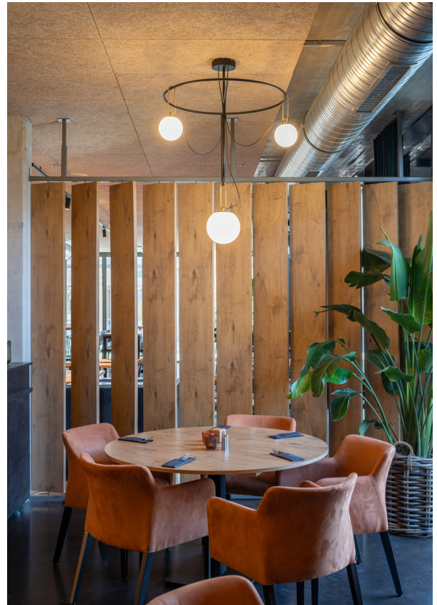
nh s4 Circulaire - Neri&Hu