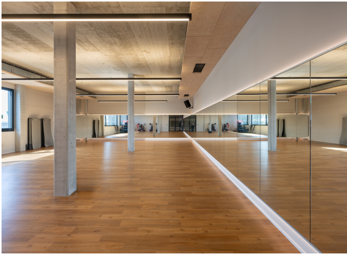
A.39 Suspension Diffused Emission - Carlotta de Bevilacqua