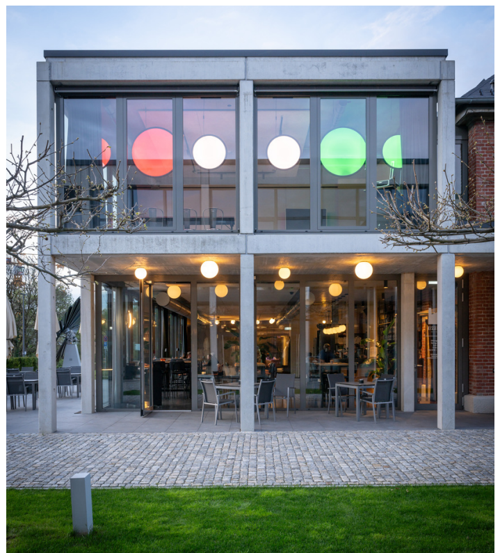
Discovery Vertical - Ernesto Gismondi | Dioscuri - Michele De Lucchi