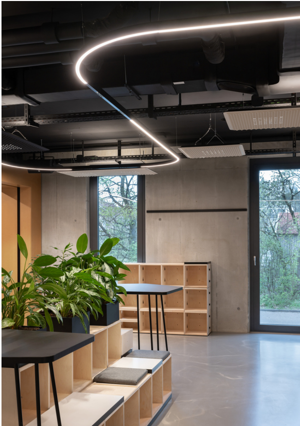
A.24 Diffused Emission - Carlotta de Bevilacqua | Eggboard Matrix - Progetto CMR Giacobone & Roj