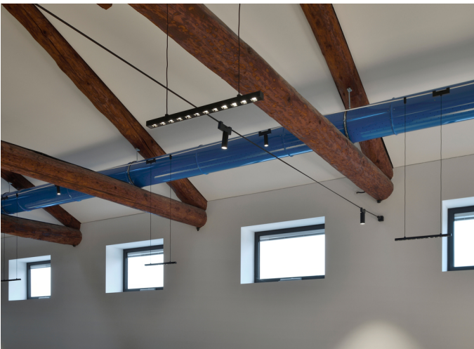
Funivia - Carlotta de Bevilacqua