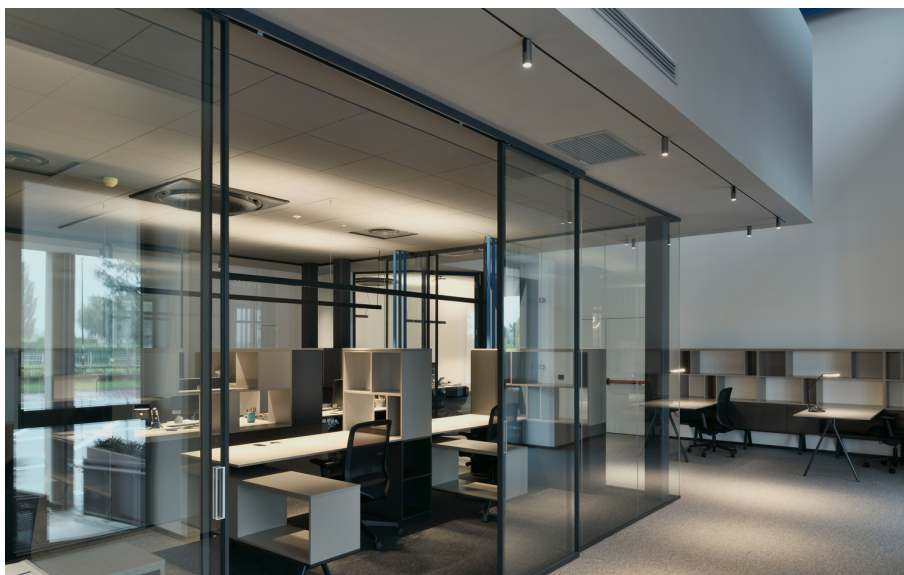
Turn Around + Vector - Carlotta de Bevilacqua