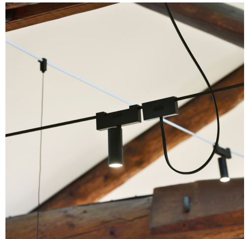
Funivia - Carlotta de Bevilacqua