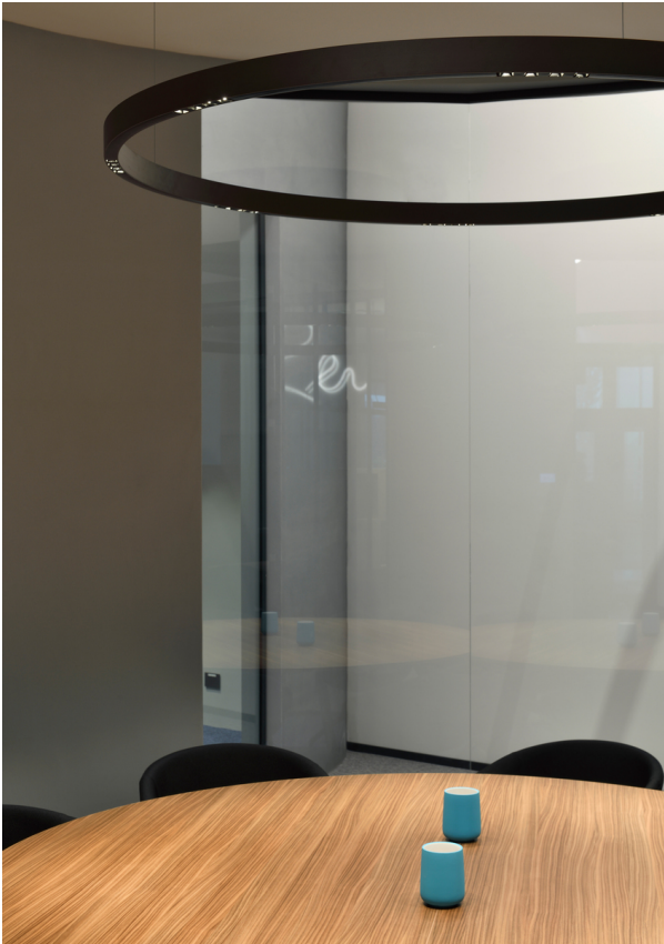
A.24 Stand Alone Sharping - Carlotta de Bevilacqua