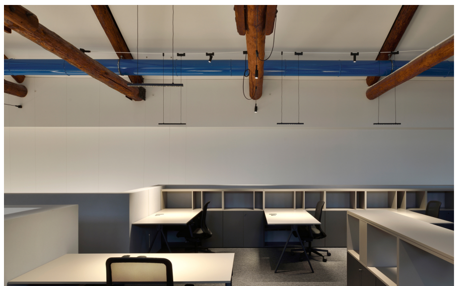
Funivia - Carlotta de Bevilacqua

The lighting blends harmoniously with the materials and acoustics, creating a space that combines modernity and efficiency, enhancing Reire's identity with a view to sustainable and innovative design .