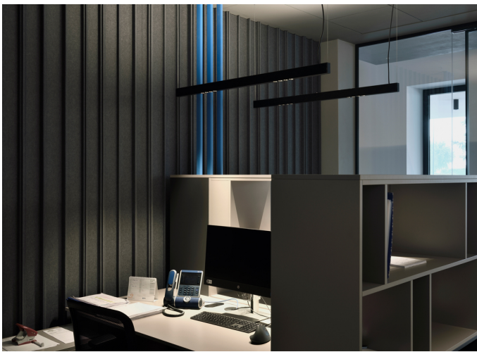
A.24 Sharping Emission - Carlotta de Bevilacqua