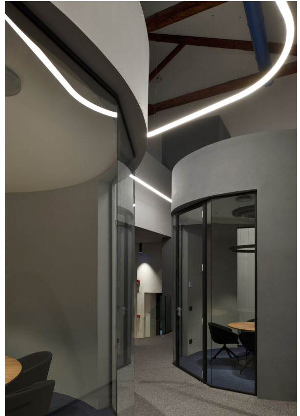
Alphabet of Light - Bjarke Ingels Group