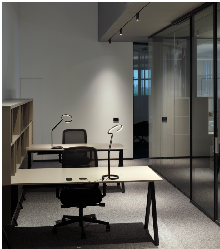
Turn Around + Vector - Carlotta de Bevilacqua | Vine Light - Bjarke Ingels Group

Reire's office lighting project transformed the space into a modern and functional environment, thanks to a lighting design aimed at optimising comfort and productivity. The choice of specific optics for the workstations ensures uniform, glare-free lighting, promoting concentration and well-being . The integration of natural light with our solutions is designed to preserve the open atmosphere and enhance the architectural features, such as the wooden trusses and glazed volumes of the meeting rooms.