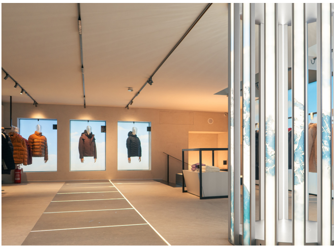
Turn Around + Vector and Sharp - Carlotta de Bevilacqua