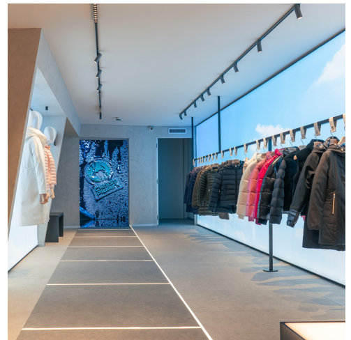
Turn Around + Vector and Sharp - Carlotta de Bevilacqua