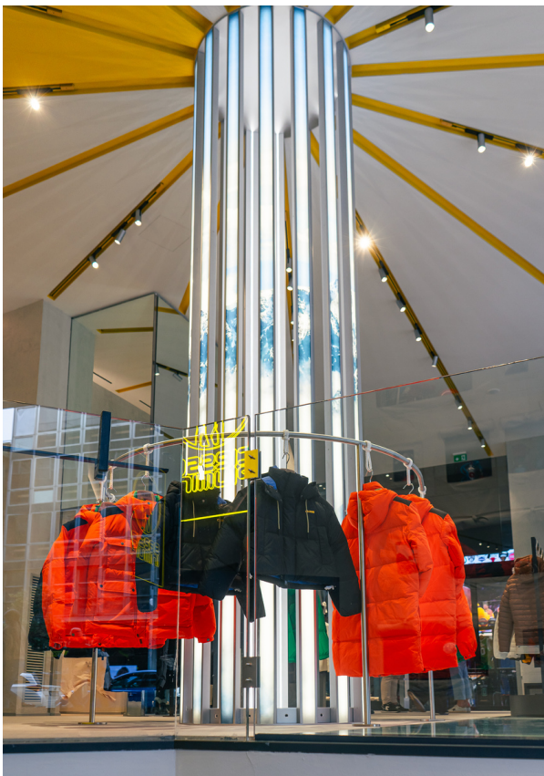
Turn Around + Vector - Carlotta de Bevilacqua