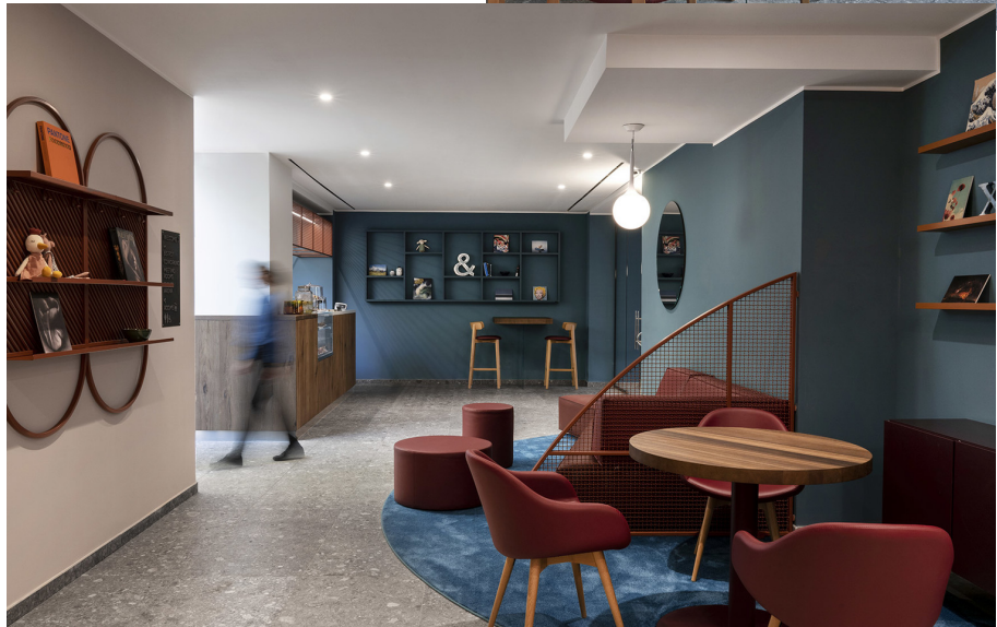
Castore - Michele De Lucchi, Everything 80 - Ernesto Gismondi