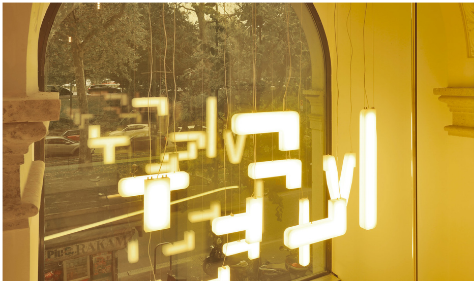
Custom Chandelier by Artemide & Carlo Ratti

➤ The aim of MEET is to rediscover a new sense of humanism – through digital