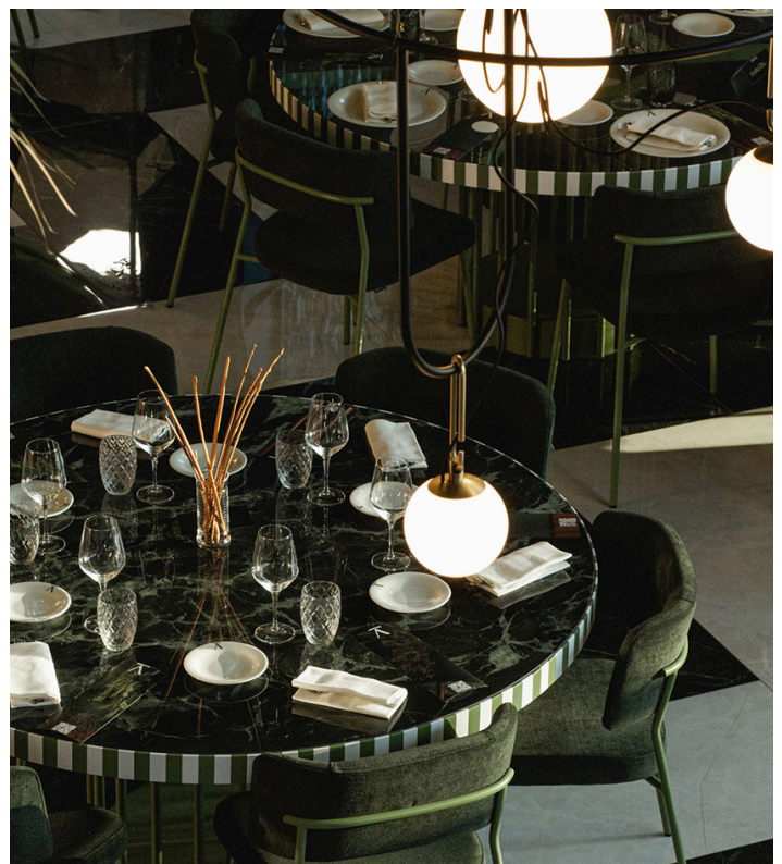
nh S4 Circulaire - Neri&Hu