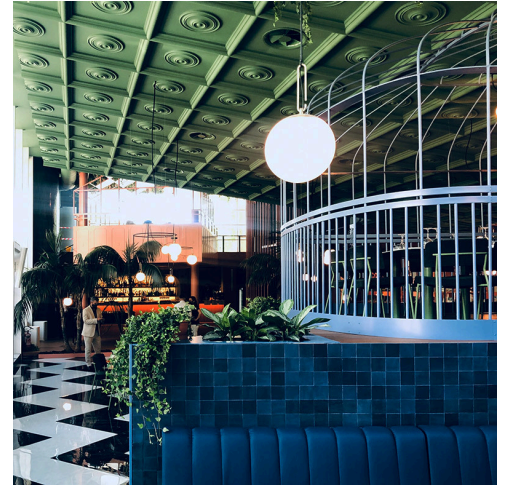
nh 35 Suspension - Neri&Hu

The renovation includes using the old cinema as a large atrium-like space.