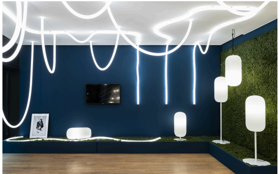
La Linea and Gople Outdoor by BIG

Artemide increasingly explicitly declares its perspective towards the future: an approach to design guided by values, driven not only by scientific research and technological and production expertise but also by a humanistic and ethical approach. Artemide has adopted a concrete path towards 360° sustainability, not only environmental but also social, as demonstrated by ISO 9001, ISO 14001 and ISO 45001 certification, membership of the United Nation Global Compact and the new sustainability report just published.