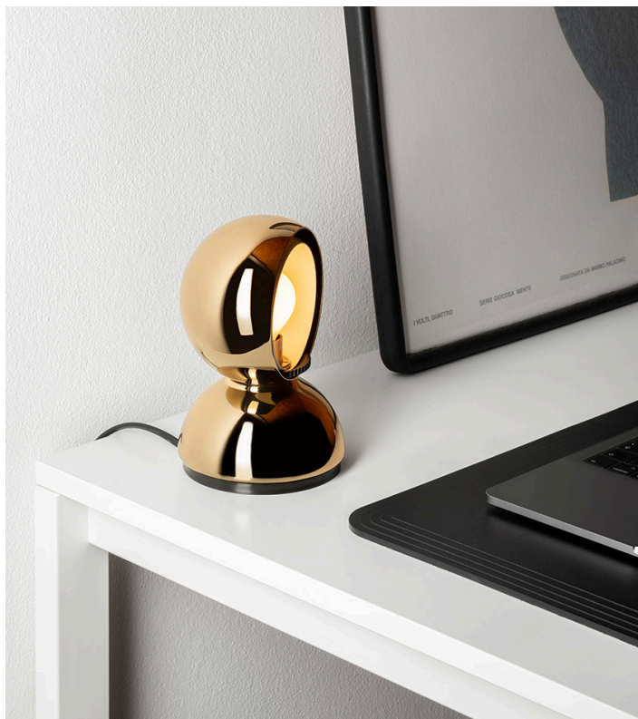
Eclisse PVD Brass - Vico Magistretti

The PVD versions of Eclisse are a perfect example of how Artemide's research into materials, finishes and processes is strongly oriented towards sustainable solutions. In the design choice, the environmental impact is a discriminating factor that imposes itself on the final aesthetic result.