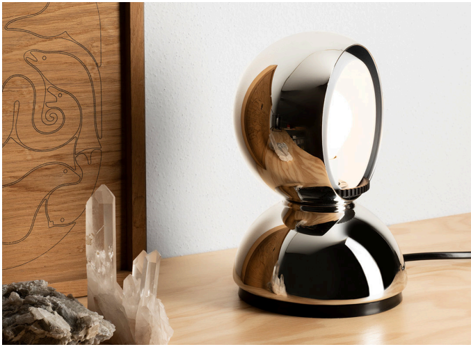
Eclisse PVD Mirror - Vico Magistretti