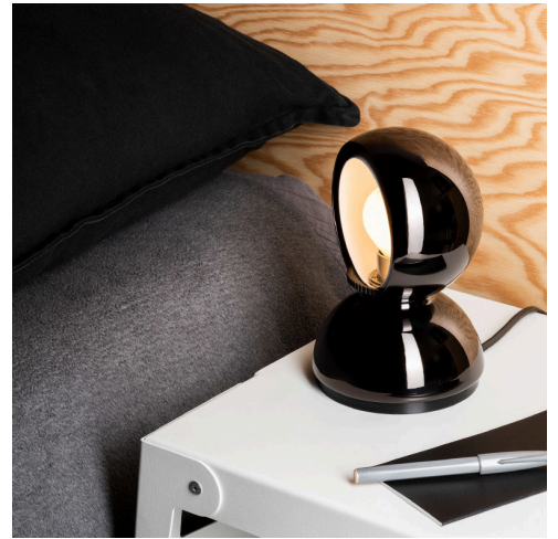
Eclisse PVD Black - Vico Magistretti