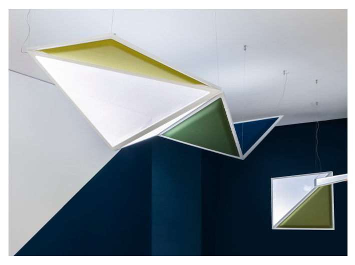
Flexia - Mario Cucinella

Both are a perfect example of Artemide's sustainable innovation.