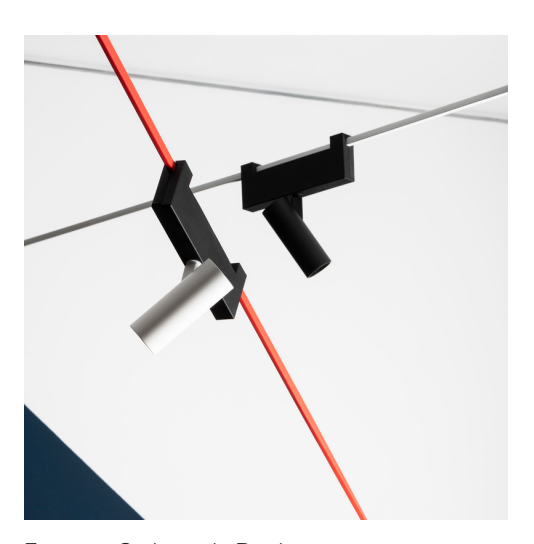
Funivia - Carlotta de Bevilacqua