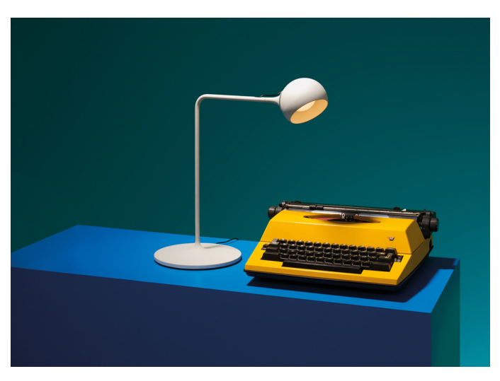
Ixa - Foster + Partners

Vine Light and Ixa will be on exhibition until 19 November at the ADI Design Museum together with the best products and services from all sectors of Italian design that will compete together for the XXVIII Compasso D'Oro award.