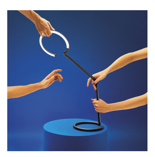
Vine Light - BIG Bjarke Ingels Group