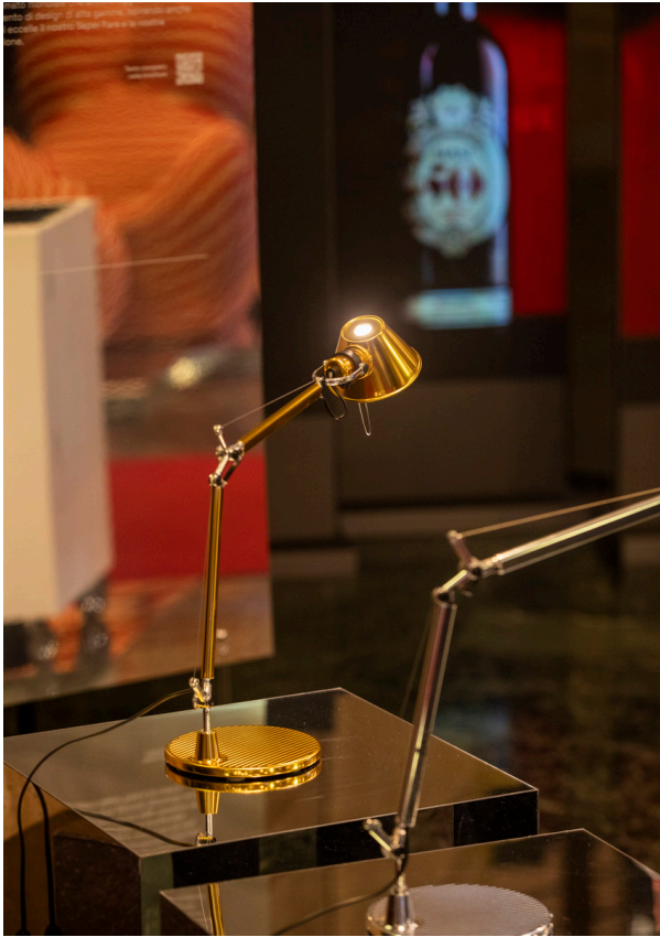
Tolomeo Micro Table - Michele De Lucchi & Giancarlo Fassina