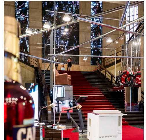
Tolomeo Pinza - Michele De Lucchi & Giancarlo Piretti

The beauty of Artemide icons thus becomes a mirror of the talent and skill of our craftsmen, offering a privileged glimpse of the culture of the Beautiful, Good and Well-made that characterises our country.