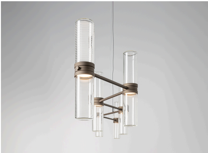
Zephyr Linear - Carlo Colombo

We are proud to announce that Zephyr , designed by Carlo Colombo , has been awarded the prestigious Archiproducts Design Award 2024 . This important recognition celebrates a project that combines the craftsmanship of glass with advanced technology, delivering lighting solutions with a high aesthetic and functional impact. Zephyr features a cylindrical diffuser made of hand-blown glass, crafted with a wavy texture that alternates between transparent and opaline stripes. This refined technique not only enhances the diffuser's aesthetic appeal but also ensures a soft, glare-free light diffusion along the entire cylinder, improving visual comfort.