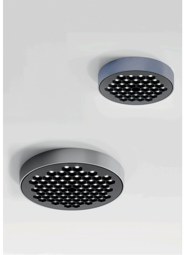
Helgoland SMD No driver version