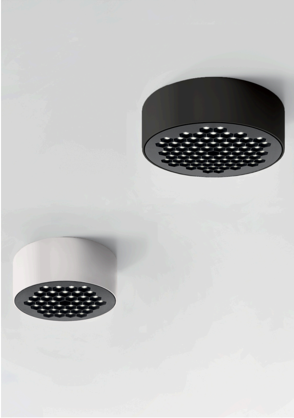
Helgoland SMD Built-in driver version