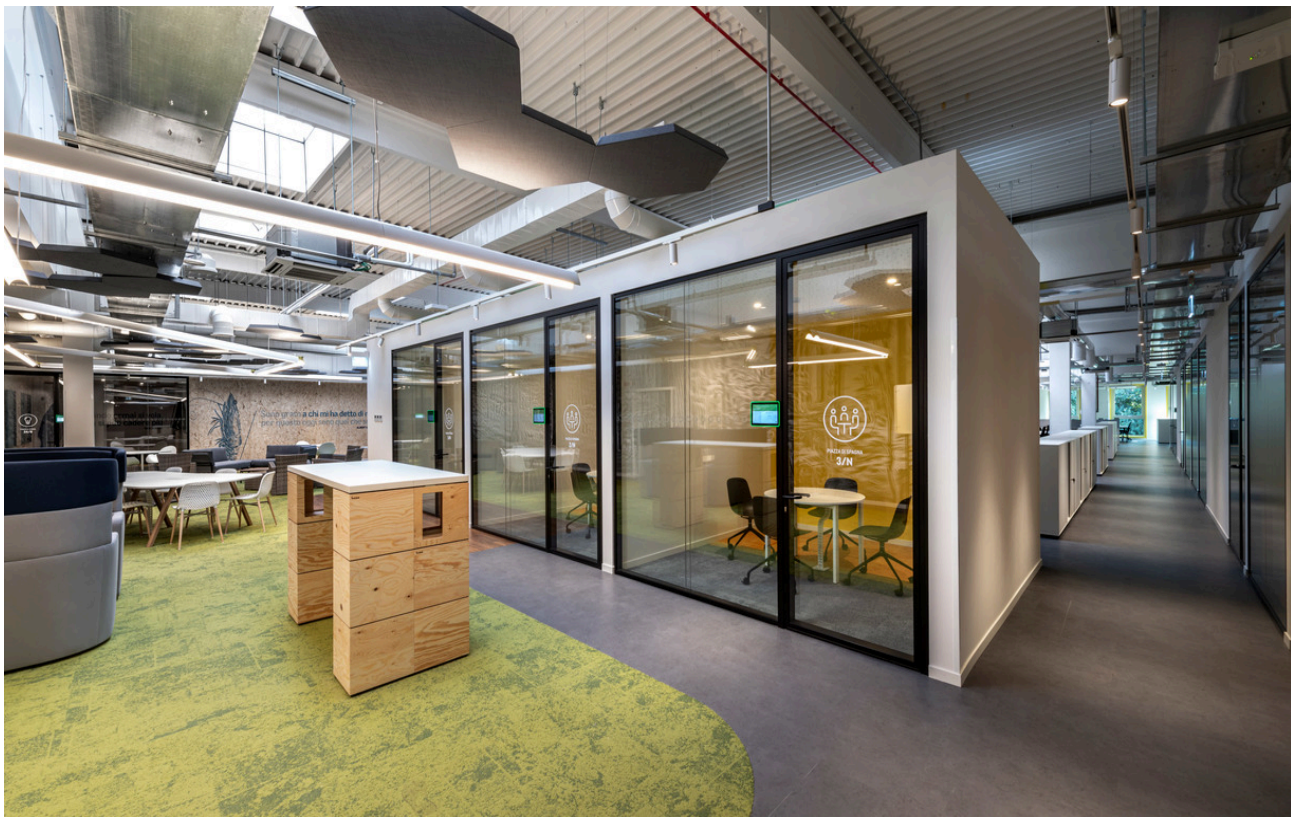
Series Y - Gensler | Vector - Carlotta de Bevilacqua