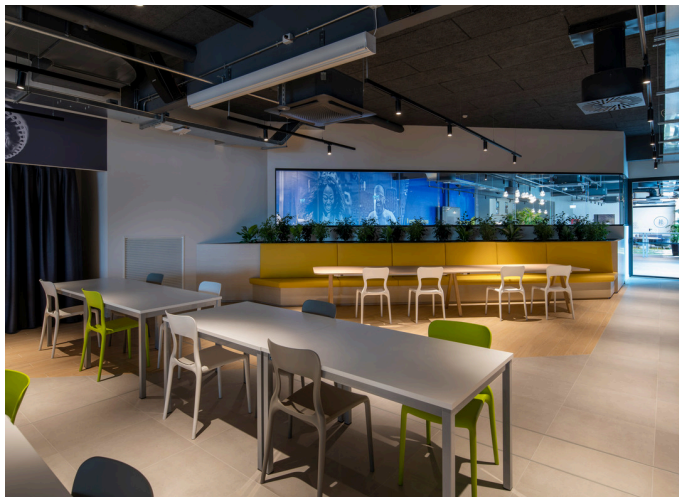
A.24 System + Vector Magnetic - Carlotta de Bevilacqua