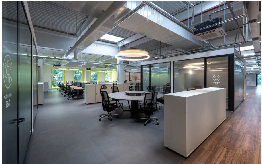
AoL Circular - Bjarke Ingels Group

The project also considered some important elements for the future use and maintenance of the offices: the space, flexible, is easily reconfigurable and scalable to accommodate changes and additions and to be able to adapt to increasing future density. Artemide lighting follows the needs of this wide variety of spaces, combining flexible systems adaptable to different layouts and functions with dynamic performance.