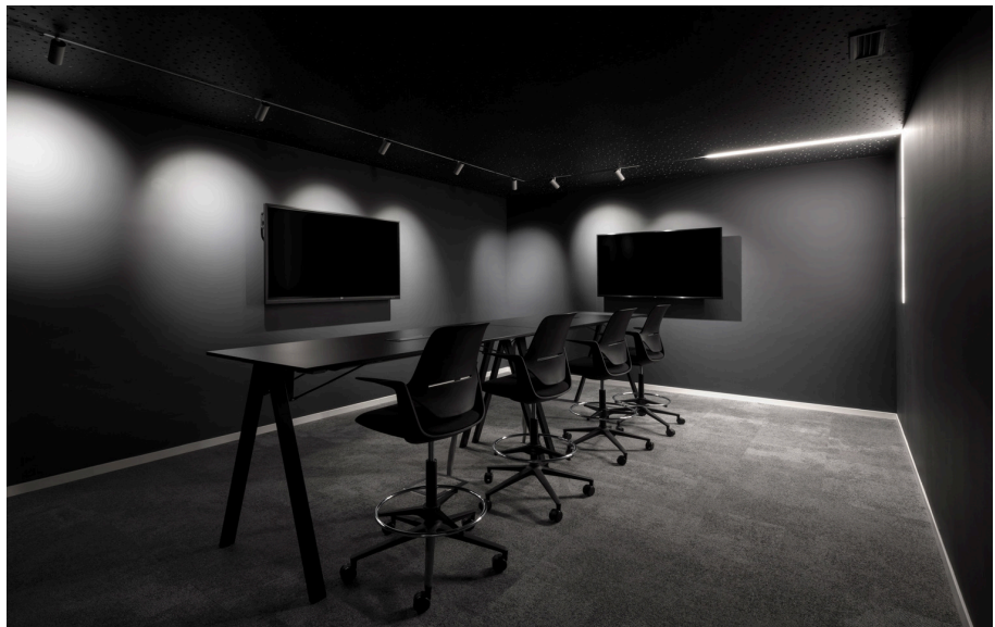
A.24 System + Vector Magnetic - Carlotta de Bevilacqua