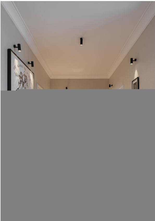
nh Floor - Neri & Hu | Vector Ceiling - Carlotta de Bevilacqua