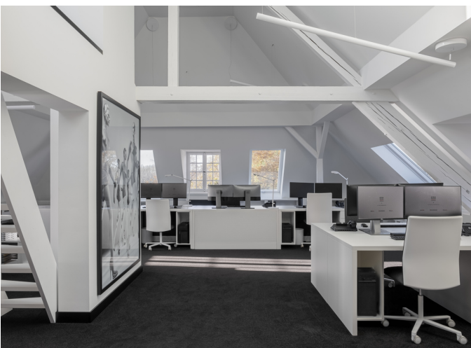
Alphabet of Light Linear - Bjarke Ingels Group | Demetra - Naoto Fukasawa