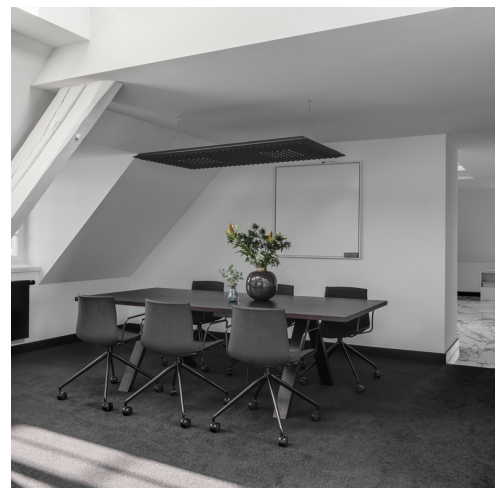
Eggboard Matrix - Progetto CMR