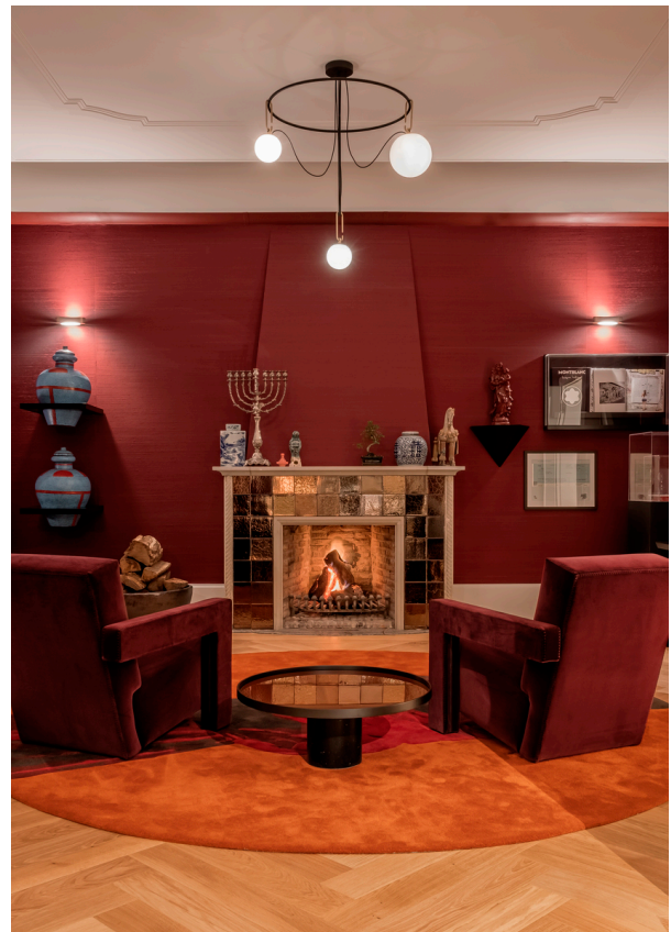
nh S4 Circulaire - Neri & Hu