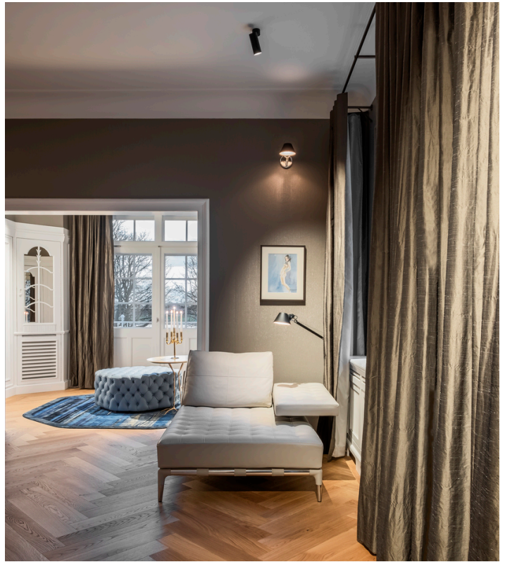
Tolomeo & Tolomeo Faretto - Michele De Lucchi