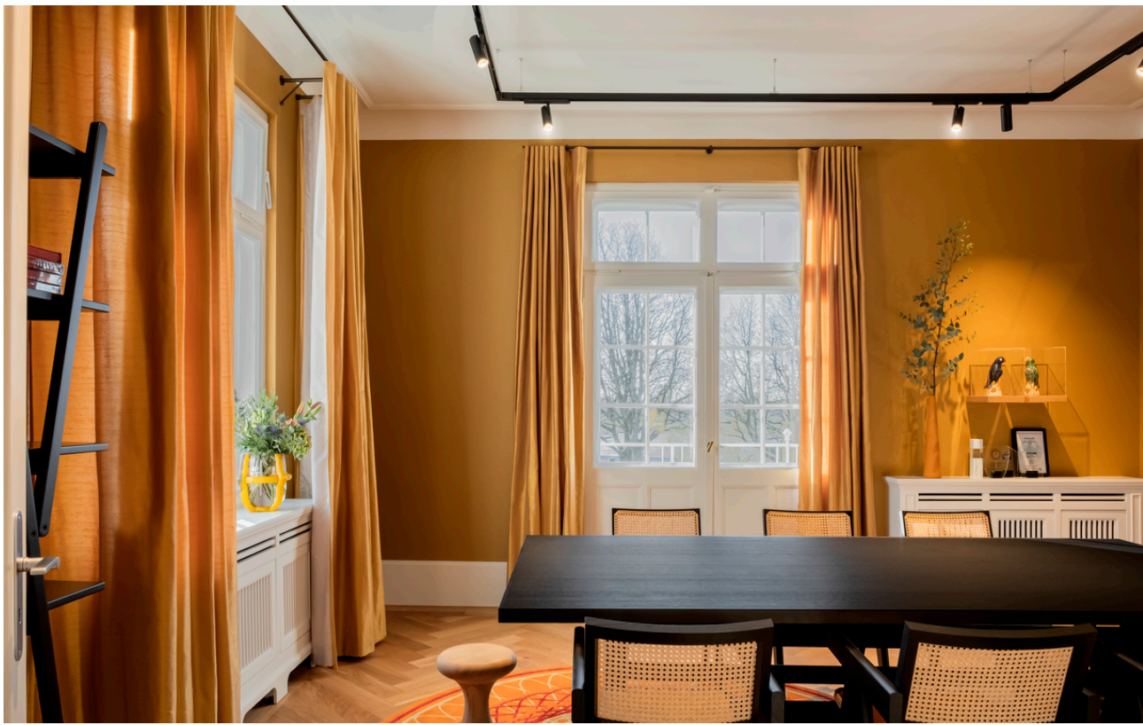
Vector Track - Carlotta de Bevilacqua