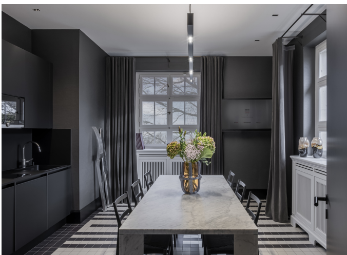
A.39 Sharping - Carlotta de Bevilacqua