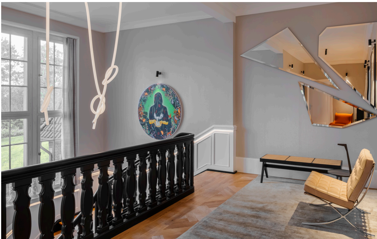
La Linea - Bjarke Ingels Group