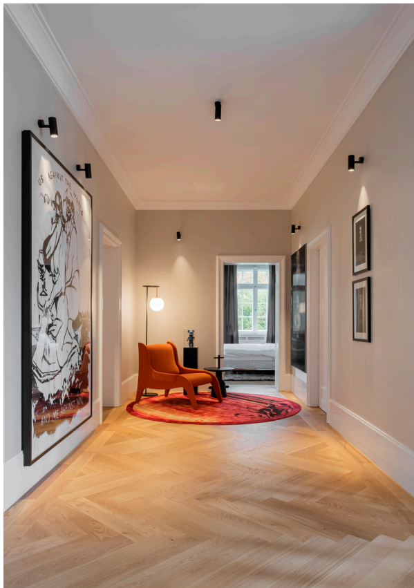
nh Floor - Neri & Hu | Vector Ceiling - Carlotta de Bevilacqua