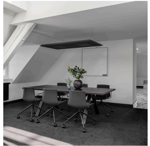
Eggboard Matrix - Progetto CMR