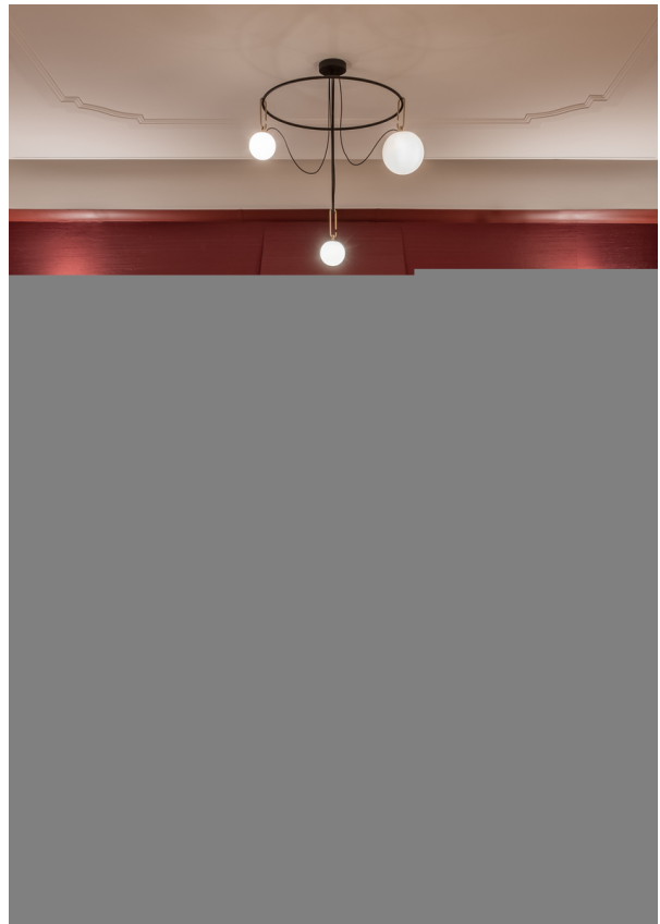
nh S4 Circulaire - Neri & Hu