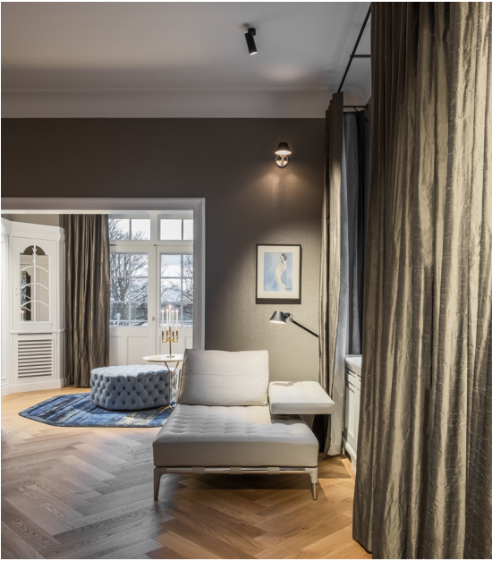
Tolomeo & Tolomeo Faretto - Michele De Lucchi