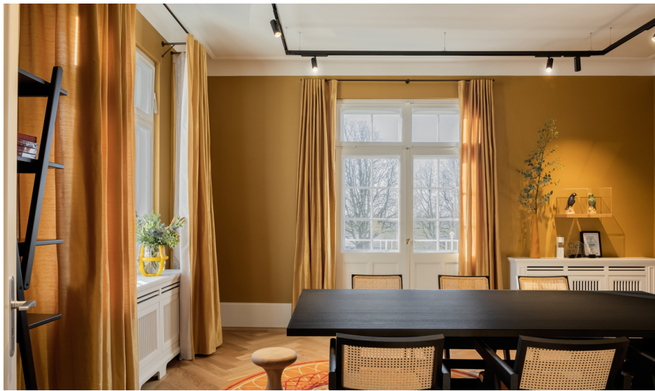
Vector Track - Carlotta de Bevilacqua