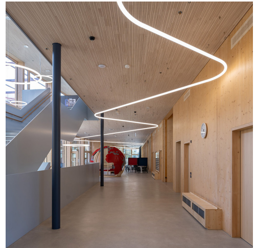
Alphabet of Light System - Bjarke Ingels Group