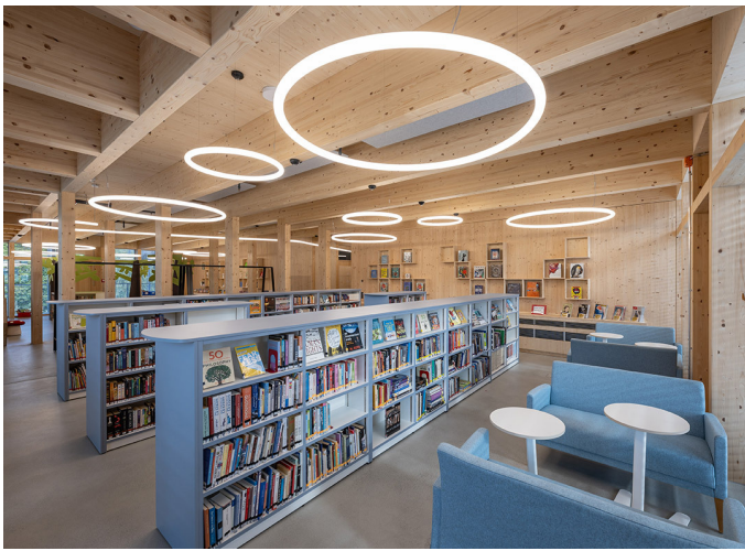
Alphabet of Light Circular - Bjarke Ingels Group