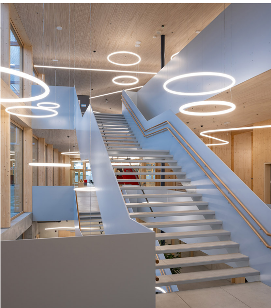
Alphabet of Light - Bjarke Ingels Group

With its open, transparent and sustainable design, the building forms a modern learning landscape for the International School Rheintal and is a model for a sustainable future.