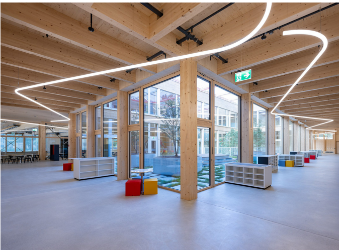
Alphabet of Light System - Bjarke Ingels Group