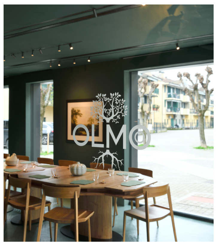
Turn Around + Vector - Carlotta de Bevilacqua

Artemide and celebrity chef Davide Oldani join forces once again to illuminate the new "Olmo" restaurant with a unique and long-established synergy. Located in a charming little square, the restaurant takes its name from the imposing tree that stands in the centre, deeply rooted in the ground and reaching upwards, symbolising stability and growth.