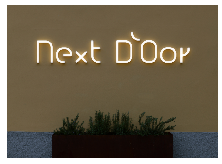
Alphabet of Light Letter Custom Outdoor - Bjarke Ingels Group