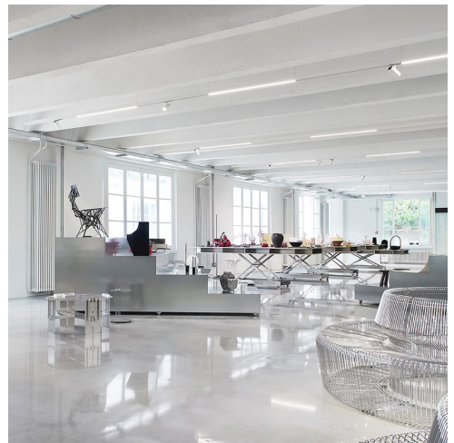
A.24 + Vector 55 - Carlotta de Bevilacqua