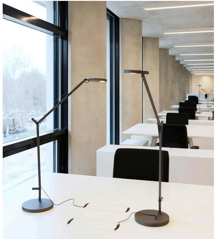
Demetra - Naoto Fukasawa

In the third and fourth floor office environments, the Algoritmo system, integrating with the architecture, defines a uniform illuminance perfect for workspaces where each workstation is also supported by Demetra task light table.