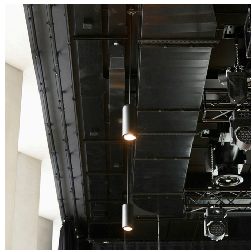
Special version of Ourea