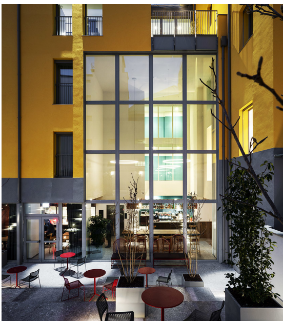
Triple height hall with Alphabet of Light Circular

21WOL is hotel, residence, bistro, coworking, event space. Not only a place to sleep, but a place of sharing, of experiential meeting, where you can feel at home even outside the house.