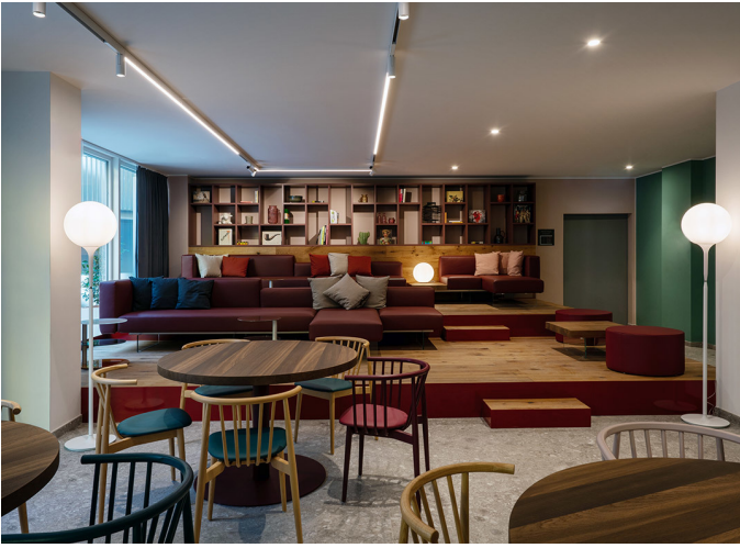
A.24 System + Vector Magnetic - Carlotta de Bevilacqua