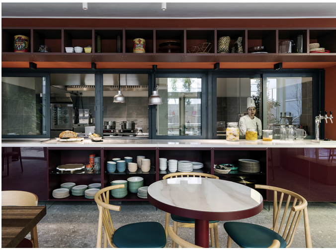
Sharp SMD - Carlotta de Bevilacqua