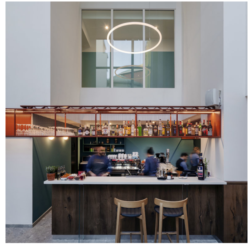
Alphabet of Light Circular - BIG

The design of the light follows the declination of the environments generating an atmosphere of sharing and emphasizing the architecture of the spaces. In public areas professional systems such as A.24 are combined with design elements such as the classic Castore and Dioscuri , in the most representative point of the project, Alphabet of Light contributes to make the triple height even more scenic.