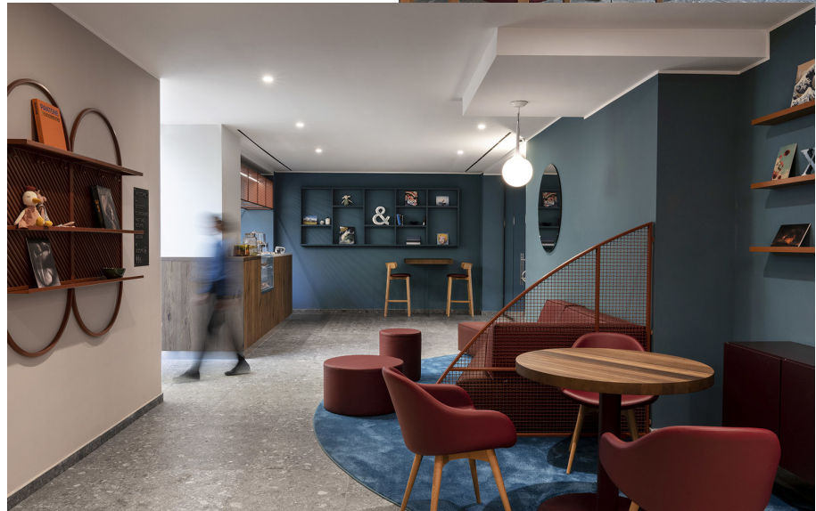
Castore - Michele De Lucchi, Everything 80 - Ernesto Gismondi