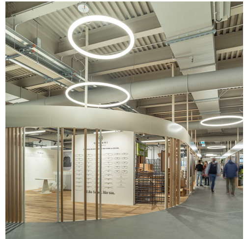
AoL Circular - BIG