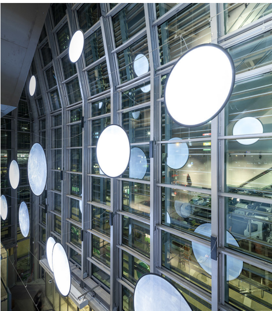
Discovery Vertical RGBW - Ernesto Gismondi

A cluster of 28 Discovery lamps, specially made in the custom size of 190cm, welcomes the visitor in the full-height space that connects the five floors. The transparent surface comes to life with a white or coloured light, green in honour of Green Pea, for a spectacular solution, which can also be glimpsed from the outside through the façade.