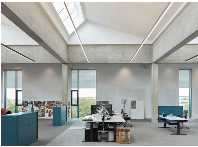
A.39 Diffused - Carlotta de Bevilacqua