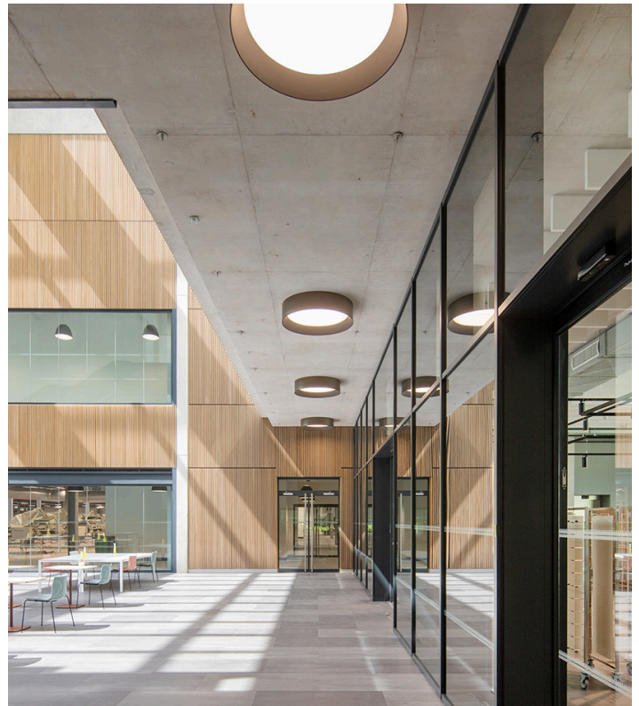
Tagora 970 Ceiling