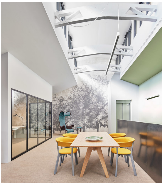
A.39 Diffused - Carlotta de Bevilacqua

The project of the new national headquarters of the AIS (Associazione Italiana Sommelier) involved the renovation and redevelopment of two existing buildings. Behind the project there was a change of perspective based on latest-generation spaces and equipment, with an eye to sustainability, one of the pillars of the project from the beginning.