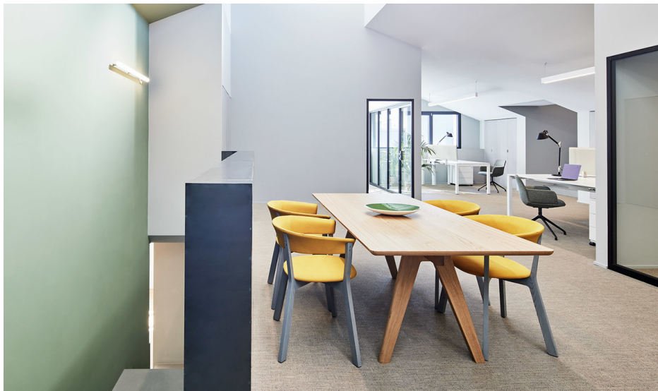
AoL Linear Wall - BIG | Tolomeo - Michele De Lucchi & Giancarlo Fassina | A.39 - Carlotta de Bevilacqua