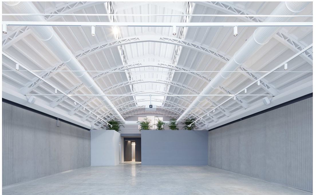
A.24 + Vector - Carlotta de Bevilacqua

The second building, also accessible from Via Plezzo, is a container designed to host events of a different cultural nature. This open space's service functions are contained in two volumes that are set alongside an access corridor.