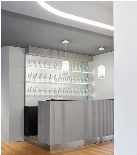
Gople Sospensione and AoL System - BIG

For the selection of the interior products used in the project, a number of Italian companies focused on the promotion of ethical work practices and on the capacity to preserve and enhance know-how and Made in Italy products have been chosen.