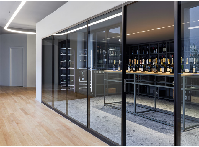
AoL System - BIG | A.24 Sharping - Carlotta de Bevilacqua