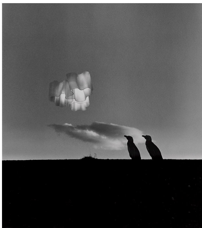
Logico, 2001

The whole Artemide collection is the expression of responsible and careful design. There is a continuous dedication and drive to develop new products in which attention to the environment is consistent and crucial to the design approach. Artemide is committed to constant research in the attempt to create lighting systems that provide a better alternative to what is already existing. Innovation is inspired by true values and demonstrated by several patents of invention which, thanks to minimal technological transfer, are immediately employed in the products.