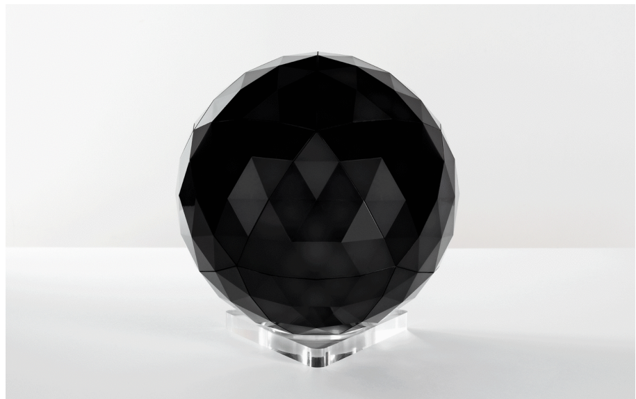
With a simple touch, can model different light scenarios