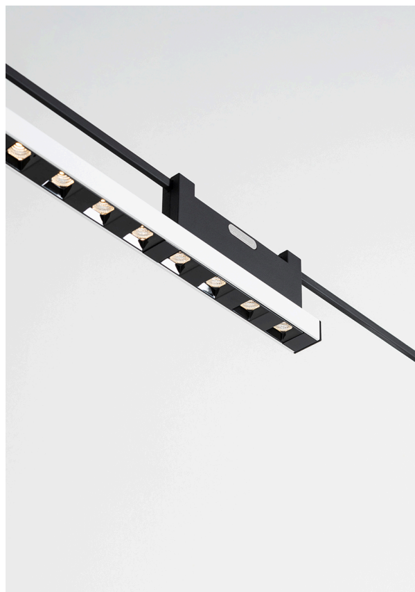
Sharp for Funivia