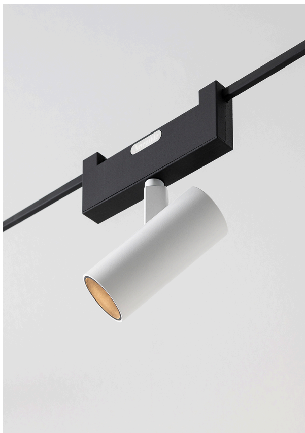
Vector Spot for Funivia

The light elements are connected to the cable via a “bridge” element, a sort of electricity connection that mechanically fixes the appliance and takes the energy from the cable to power it.