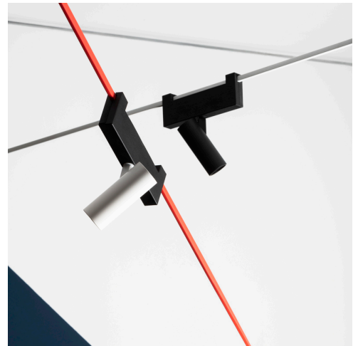
Funivia - Carlotta de Bevilacqua