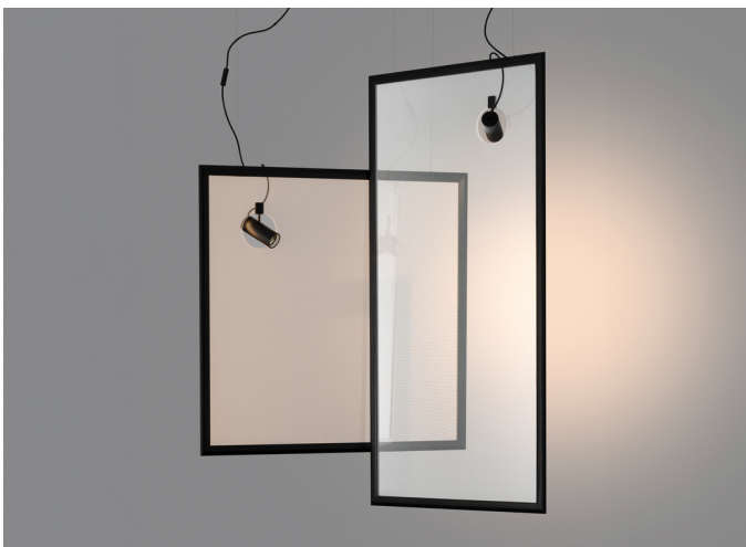
Discovery Space Spot - Ernesto Gismondi

The patented Discovery technology creates an element that doesn't invade the environment, totally absent and dematerialised when switched off, it gains volume when switched on thanks to the light that draws the central emitting surface. These generate a precise and punctual light extraction according to a flow balance with respect to the emitting surface that guarantees perfect visual comfort, an enveloping and constant light on both sides.