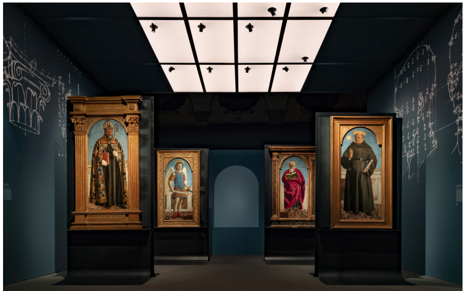
Discovery Space Spot - Ernesto Gismondi

The patented Discovery technology creates an element that doesn't invade the environment, totally absent and dematerialised when switched off, it gains volume when switched on thanks to the light that draws the central emitting surface. These generate a precise and punctual light extraction according to a flow balance with respect to the emitting surface that guarantees perfect visual comfort, an enveloping and constant light on both sides.