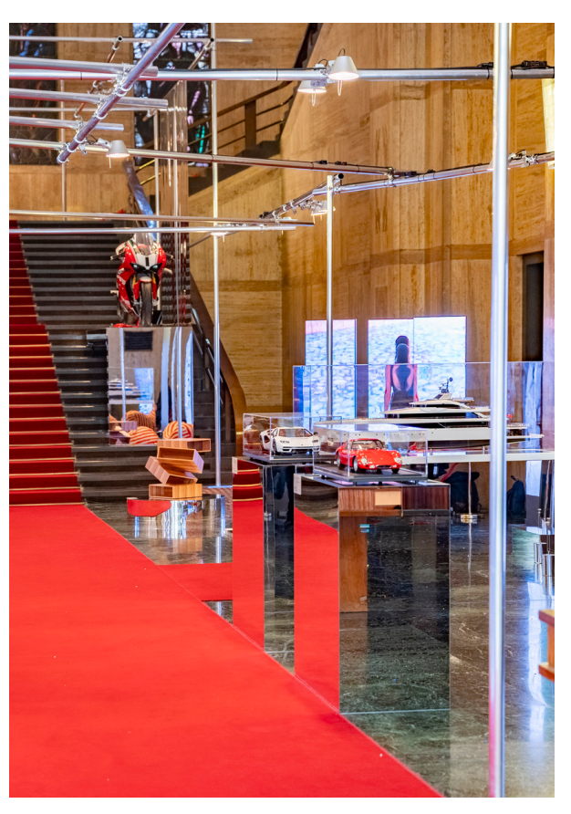
Tolomeo Pinza - Michele De Lucchi & Giancarlo Fassina