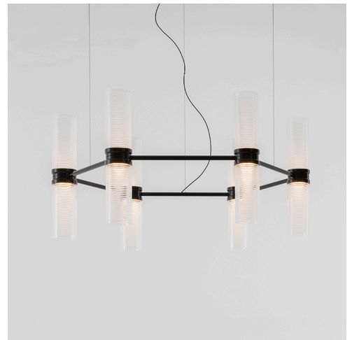
Zephyr Ring - Carlo Colombo