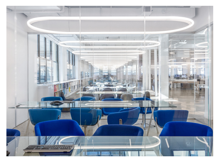
Alphabet of Light - System