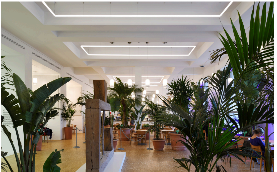
Gople - BIG | Alphabet of Light - BIG

Alphabet of Light, by BIG, enhances the architecture with continuous lines of diffused and comfortable light that follow it thanks to the flexibility of the patented system.