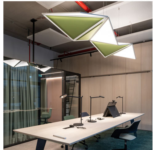
Flexia - Mario Cucinella | Demetra Table - Naoto Fukasawa