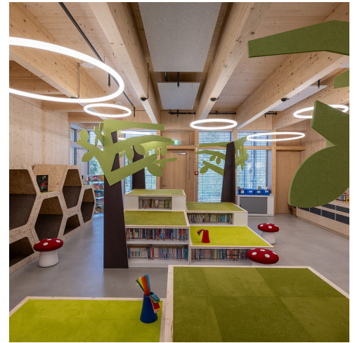
Alphabet of Light Circular - Bjarke Ingels Group

Alphabet of Light , both system and stand alone, perfectly integrate within these very simple and minimal environments, perfectly fulfilling the task of illuminating with a light that is not only functional but also aesthetically pleasing. The Artemide lighting solution seamlessly becomes part of the architectural narrative, enhancing the overall atmosphere within the school. The choice of Alphabet of Light aligns seamlessly with the sustainability ethics embraced by the International School Rheintal. Artemide's commitment to sustainable solutions is reflected in the product's energy efficiency and use of recyclable materials.