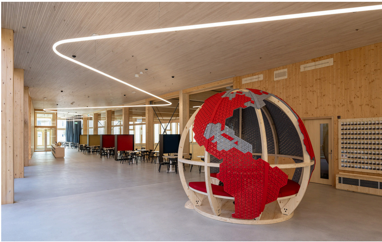
Alphabet of Light System - Bjarke Ingels Group

Alphabet of Light by Artemide not only illuminates the spaces within the International School Rheintal but also sheds light on the school's dedication to a greener and more sustainable future.