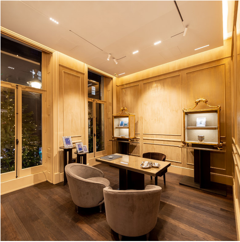
A.24 Magnetic + Vector Spot - Carlotta de Bevilacqua