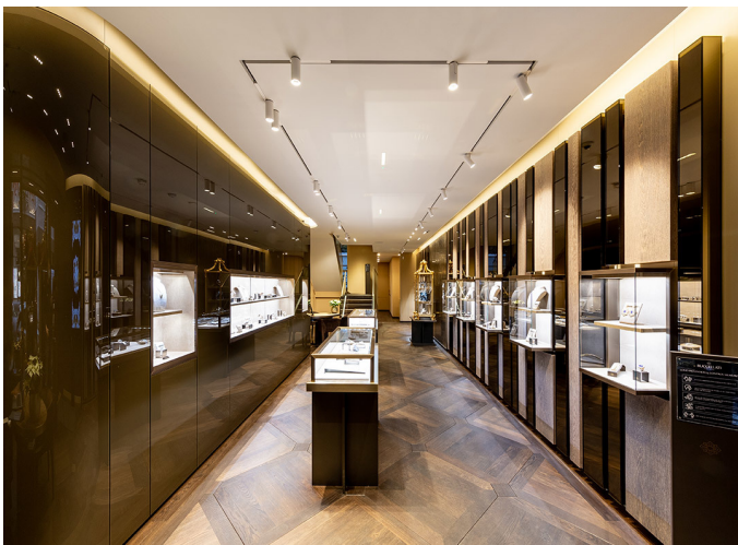
A.24 System + Vector Magnetic - Carlotta de Bevilacqua

Buccellati is one of the most recognized and celebrated jewelers and goldsmiths in Italy, famous for its intricate and textural details with the highest quality materials. The brand is synonymous with Artemide brand values. Artemide lit up the London boutique with A.24 System , an open platform that can manage multiple lighting tools to achieve seamless integration into the space, and furthermore allowing the designer to apply the correct typology and dose of light where appropriate.