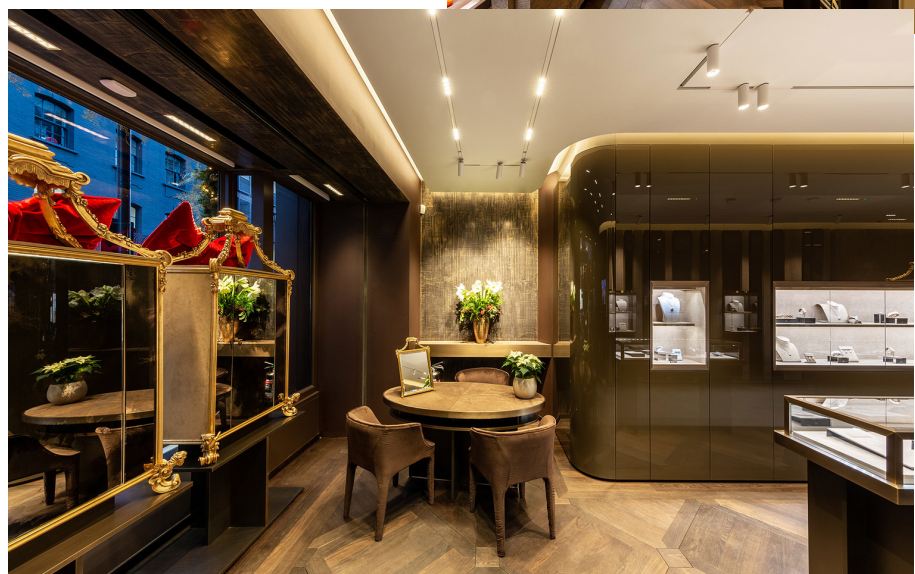
A.24 System + Vector Magnetic | Sharp Recessed - Carlotta de Bevilacqua