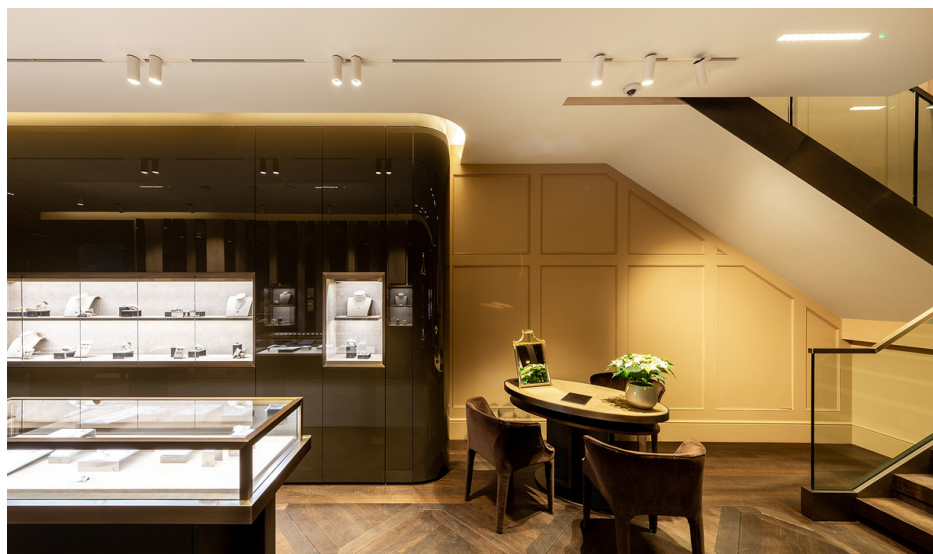
A.24 System + Vector Magnetic | Sharp Recessed - Carlotta de Bevilacqua