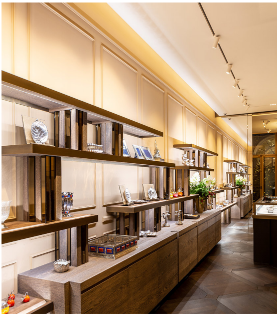
A.24 System + Vector Magnetic - Carlotta de Bevilacqua

Buccellati is one of the most recognized and celebrated jewelers and goldsmiths in Italy, famous for its intricate and textural details with the highest quality materials. The brand is synonymous with Artemide brand values. Artemide lit up the London boutique with A.24 System , an open platform that can manage multiple lighting tools to achieve seamless integration into the space, and furthermore allowing the designer to apply the correct typology and dose of light where appropriate.