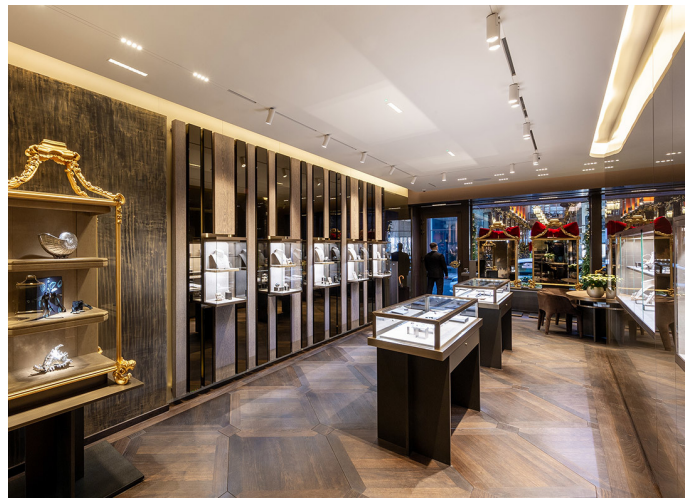
A.24 System + Vector Magnetic - Carlotta de Bevilacqua