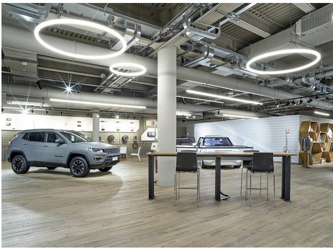
AoL Circular, AoL Linear - BIG