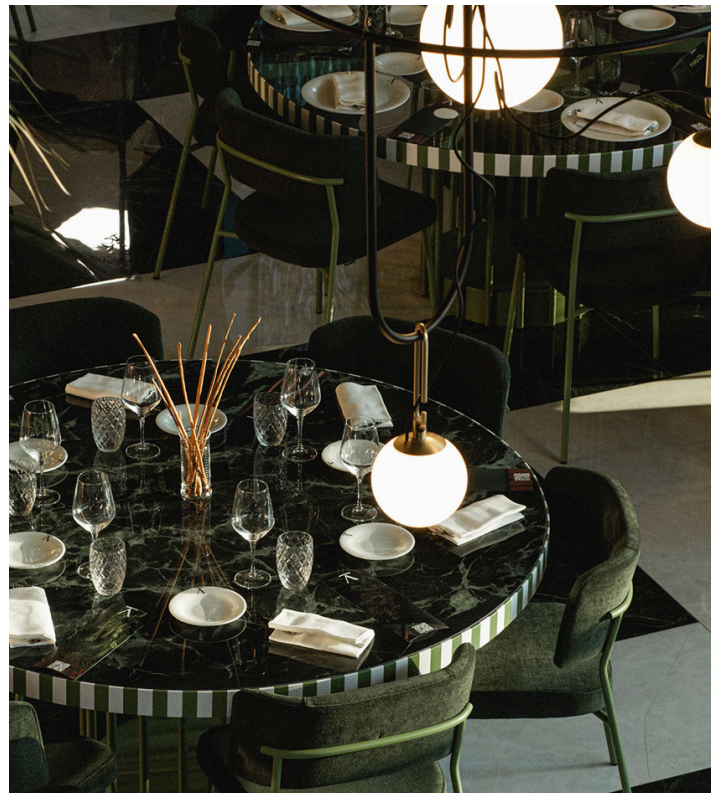
nh S4 Circulaire - Neri&Hu