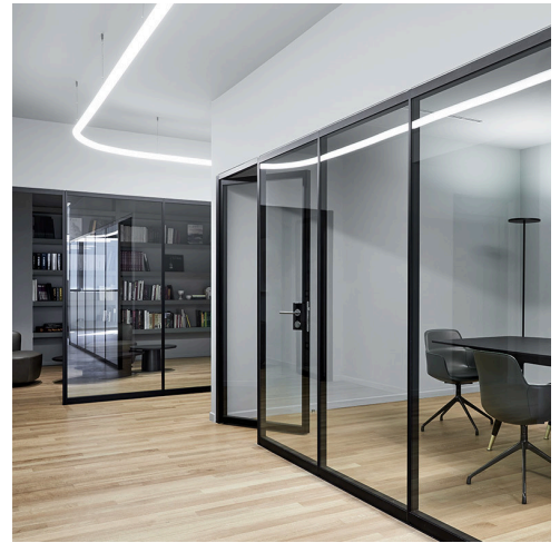
AoL System - BIG

The space is designed to contain and allow different activities to be carried out. Inside this first building there are rooms of various functional types, including a thematic library, a wine cellar containing about three thousand bottles, a lounge area, a bar, a kitchen and a small green area.