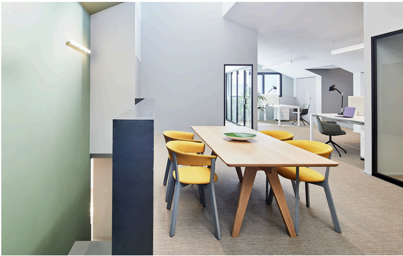
AoL Linear Wall - BIG | Tolomeo - Michele De Lucchi & Giancarlo Fassina | A.39 - Carlotta de Bevilacqua

For the selection of the interior products used in the project, a number of Italian companies focused on the promotion of ethical work practices and on the capacity to preserve and enhance know-how and Made in Italy products have been chosen. It was precisely because of this design philosophy that Bertero Projects chose Artemide for all the lighting in the spaces. The philosophy of "The Human and Responsible Light", competence and innovation but also an expression of research and high quality manufacturing are the basis of the long collaboration with the studio.