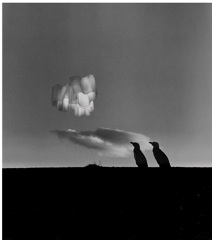
Logico

The whole Artemide collection is the expression of responsible and careful design. There is a continuous dedication and drive to develop new products in which attention to the environment is consistent and crucial to the design approach. Artemide is committed to constant research in the attempt to create lighting systems that provide a better alternative to what is already existing. Innovation is inspired by true values and demonstrated by several patents of invention which, thanks to minimal technological transfer, are immediately employed in the products.