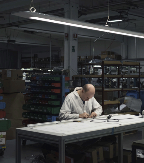
Artemide Factory, Pregnana Milanese

➤ Artemide's tangible commitment to 360° sustainability, not only environmental but also ethical, is a direction that has earned the company ISO 9001, ISO 14001 and ISO 45001 certifications.