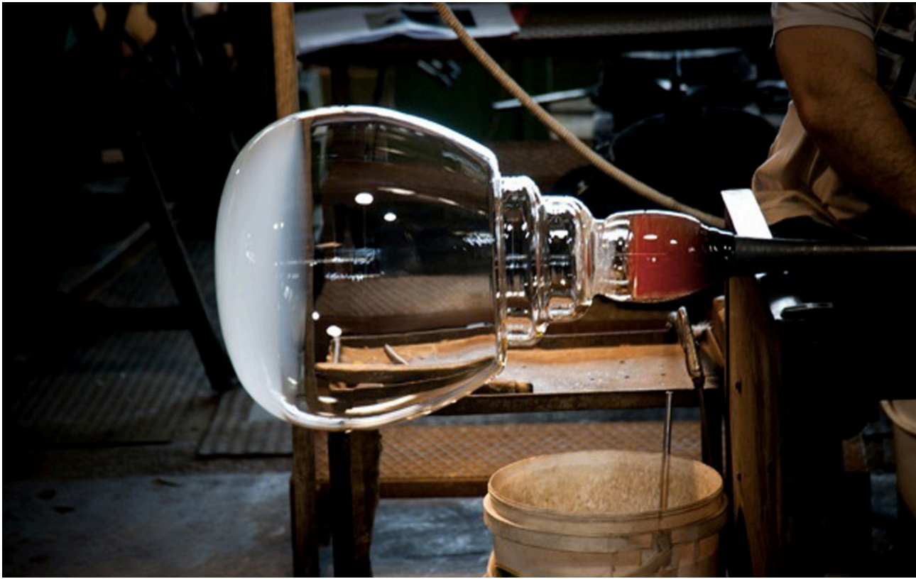
Vetrofond, Glass Workshop

➤ Artemide applies design criteria that aim to optimise the efficiency of its products and pays the highest attention to control the energy consumption.