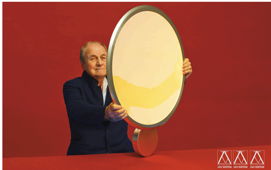
Ernesto Gismondi with Discovery

Over the years Artemide has pursued a constant progress in the direction of a design process that is both conscious and respectful of men and the planet. This commitment is now documented and measured through the Sustainability Report, in order to highlight all the values that guide Artemide's outlook towards the future. Following the GRI - Global Reporting Initiative - guidelines, the company declares and certifies, according to a core approach, performance indicators and measurable objectives for environmental and social sustainability. It is a transparent approach that shows how Artemide promotes tangible actions at all levels in order to improve the quality of our future.