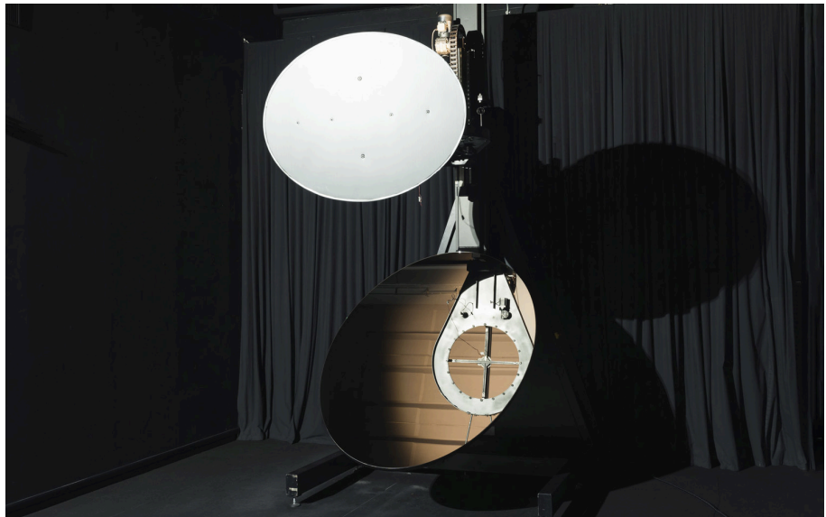
Mirror Photogoniometer, Artemide Research and Development Department